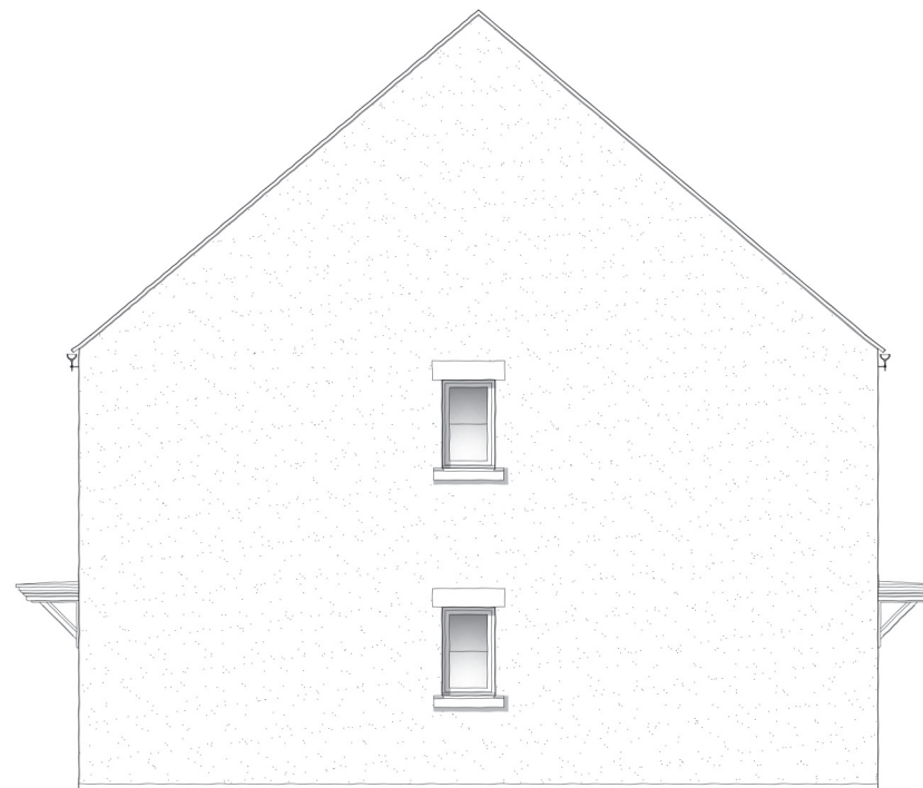
SIDE ELEVATION House Type BB2 (as) Plot 223 & 224

■ The NOBLE Consultancy ■ ■ Architectural ■ Planning ■ Urban Design ■ Landscaping ■ The Stables, Says Court Farm, Badminton Road Frampton Cotterell, South Gloucestershire, BS36 2NY □ T: 0844 7452033 □ E: design@noble-consultancy.co.uk W: www.noble-consultancy.co.uk