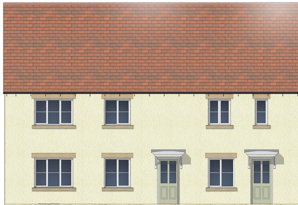
REAR ELEVATION House Type BB2 (as) Plot 223 & 224