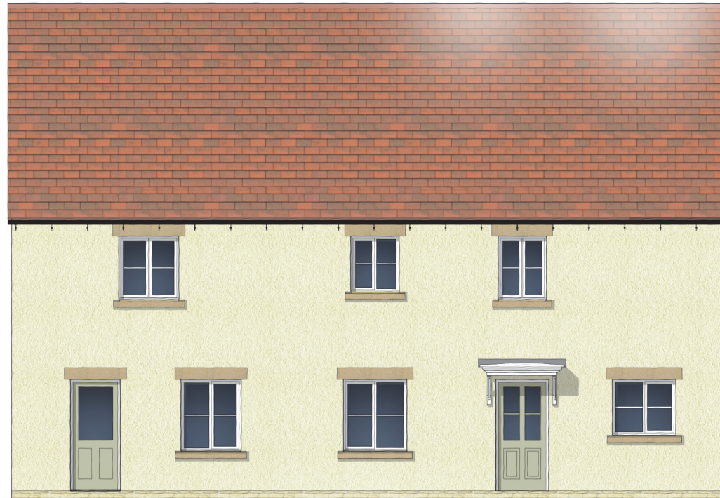
FRONT ELEVATION House Type EEG (as) Plot 225

0 1m 2m 3m 4m 5m Sheet Size A3 Rev Date Init