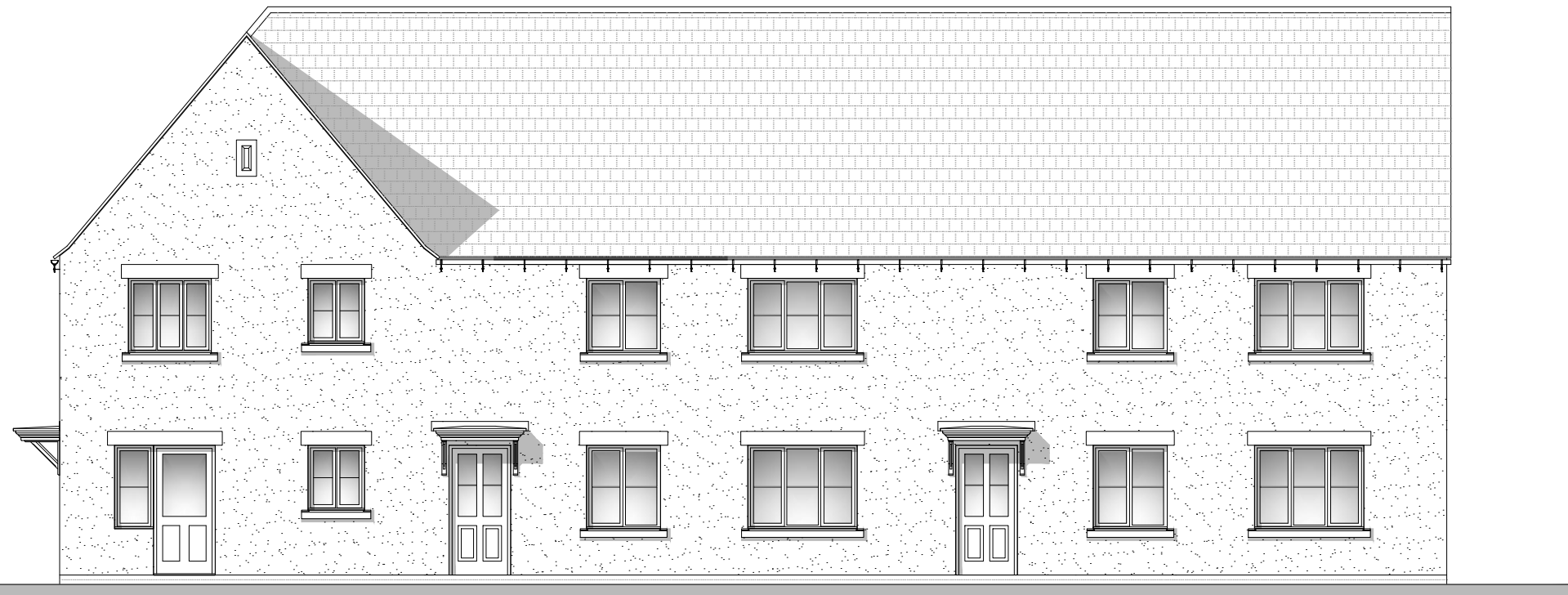
REAR ELEVATION House Type BB2 (as) Plot 217 & 218