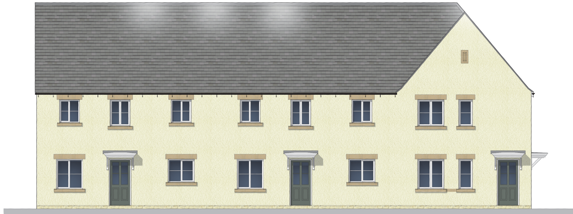
FRONT ELEVATION House Type BB2 (as) Plot 221 & 222

Rev Date Init A 12/11/14 TE Ground & first floor plans replanned to omit porch extension from front elevation. - as planners comments