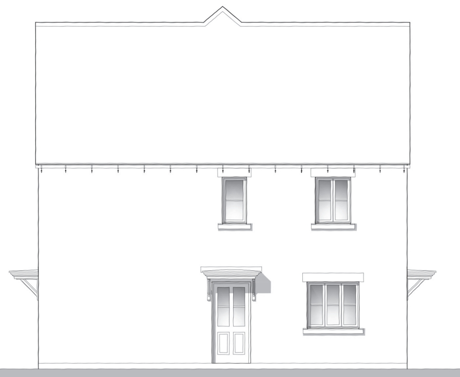
SIDE ELEVATION House Type AA2 (as) Plot 217 & 218

Gross Area (structural) GF AA2 - 43.54 m 2 - 469 ft 2 GF BB2 - 64.22 m 2 - 691 ft 2 FF AA2 - 51.98 m 2 - 560 ft 2 FF BB2 - 74.65 m 2 - 804 ft 2