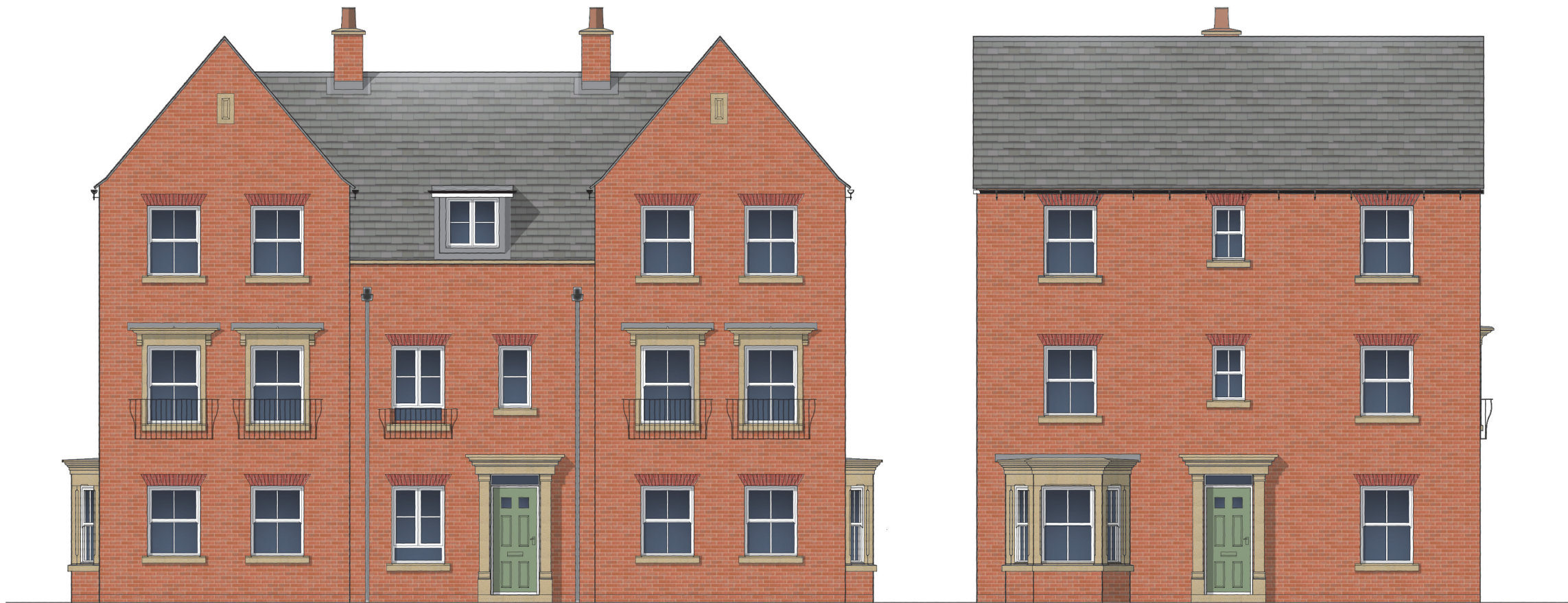
FRONT / SIDE ELEVATION

Rev Date Init A 12/11/14 PK Parapets removed, Render removed, Brick detail removed, Brick heads added to windows, Dormer amended. - as planners comments