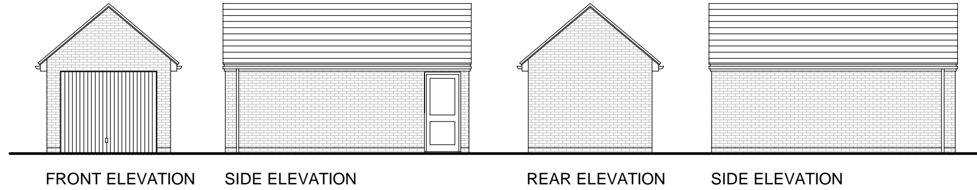
FRONT ELEVATION SIDE ELEVATION REAR ELEVATION SIDE ELEVATION

PERSONNEL DOOR SUBJECT TO SITE LEVELS & GARDEN LOCATION