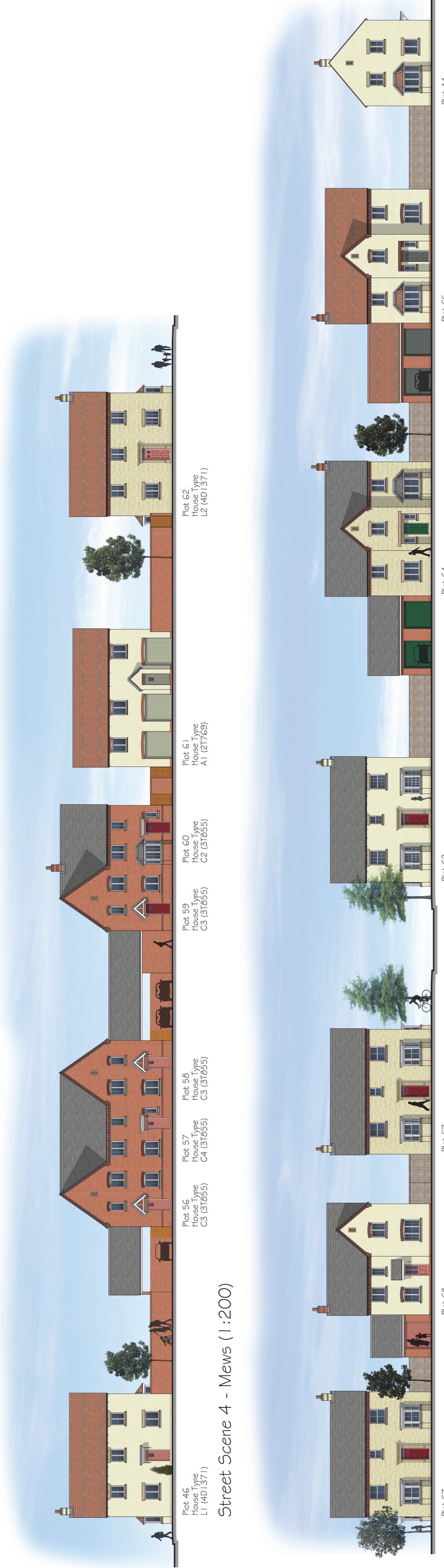
Plot 45 House Type L1 (4D|371)

Sheet Size: A1 The contractor is to check and verify all building and site dimensions, levels and lower levels before construction starts. They are to ensure that all building and site dimensions are correct and to report any discrepancies to the architect immediately. Details of any discrepancies, including drawings, photographs, and/or other evidence, shall be submitted to the architect immediately. Details of any discrepancies, including drawings, photographs, and/or other evidence, shall be submitted to the architect immediately. Rev Date Int