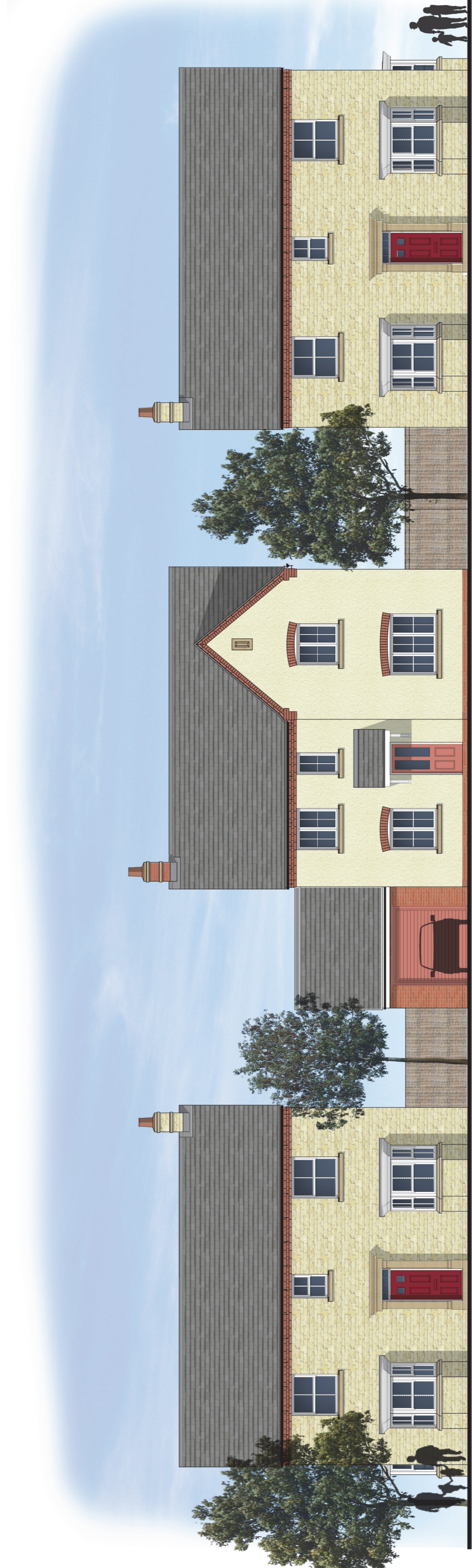
Plot 67 House Type N3 (4D|564)