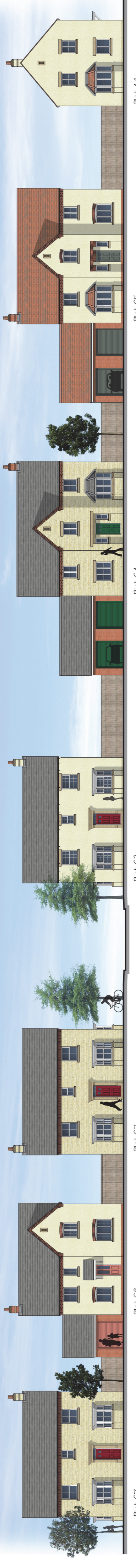
Plot 67 House Type N3 (4D|564)