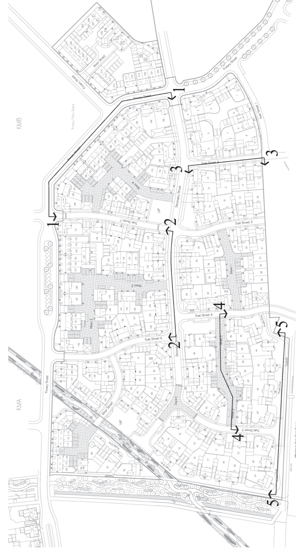
Layout Scale 1 : 2000