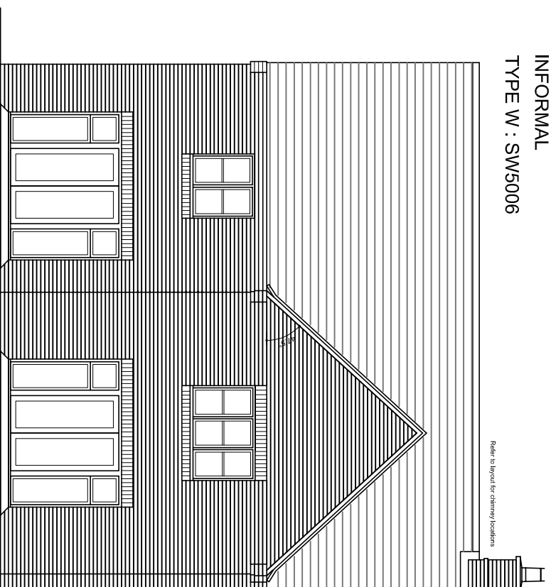
REAR ELEVATION INFORMAL TYPE W : SW5006