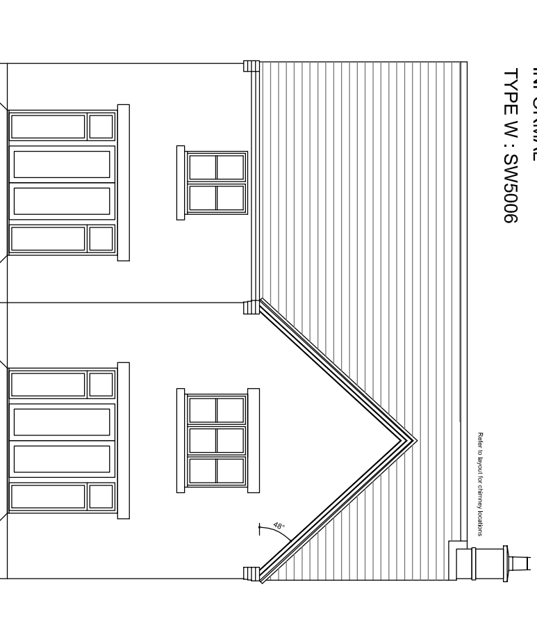
REAR ELEVATION INFORMAL TYPE W : SW5006