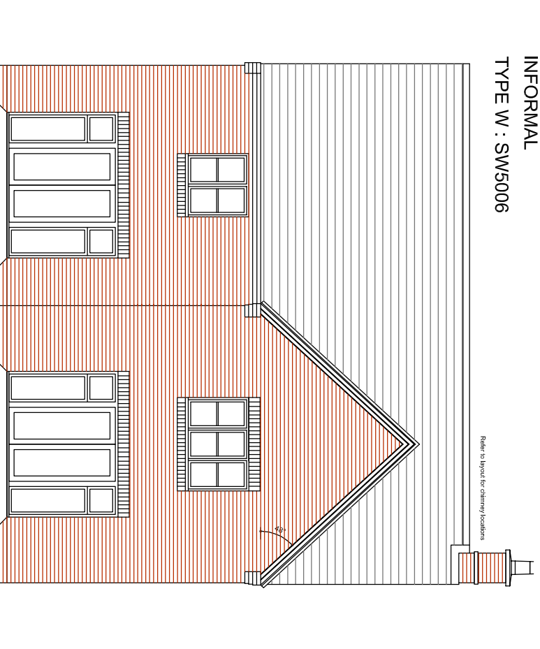
REAR ELEVATION INFORMAL TYPE W : SW5006