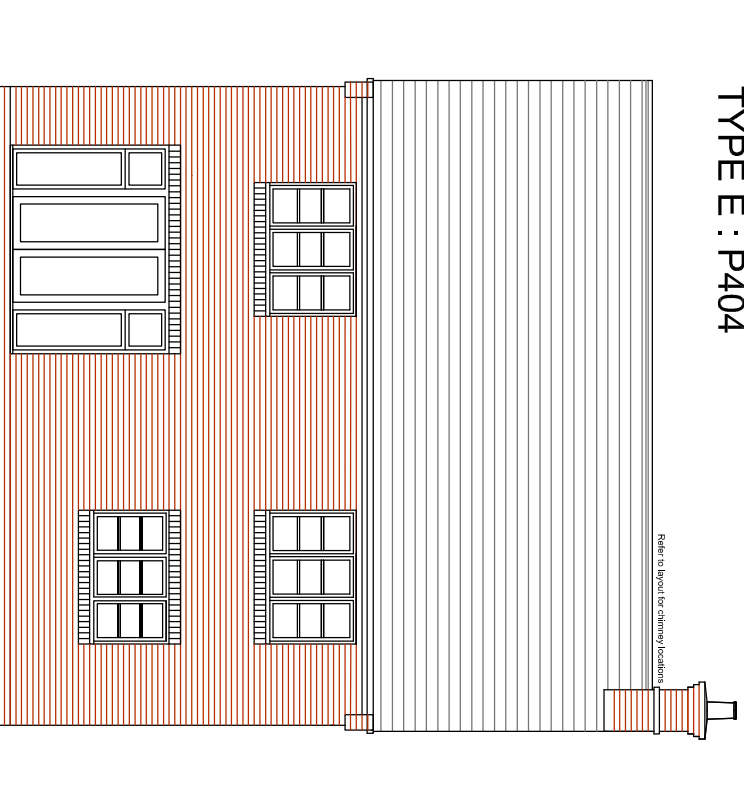
REAR ELEVATION INFORMAL TYPE E : P404