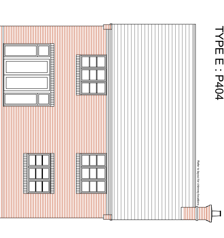
REAR ELEVATION FORMAL TYPE E : P404