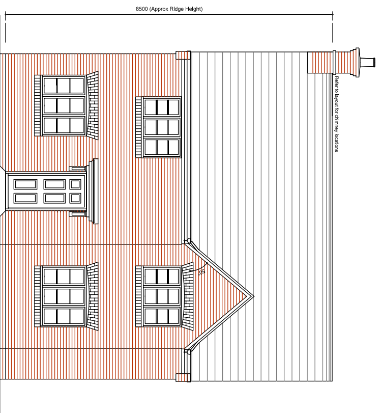
FRONT ELEVATION FORMAL TYPE E : P404