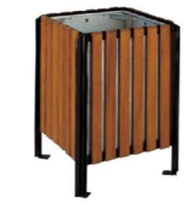
4 Iroka Woolbrook Litter bin

Benches and Litter Bins Orchard Street Furniture tel:- 01491 642123 email:- sales@orchardstreet.co.uk. www.orchardstreet.co.uk