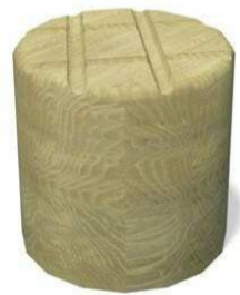
2 Playdale log walk ref AT (D8)