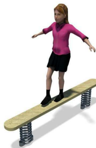
3 Playdale Wobble board ref WBD