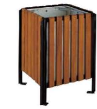
4 Iroka Woolbrook Litter bin

Benches and Litter Bins Orchard Street Furniture tel:- 01491 642123 email:- sales@orchardstreet.co.uk. www.orchardstreet.co.uk