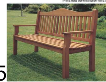
5 Iroka traditional arched bench with flat arms