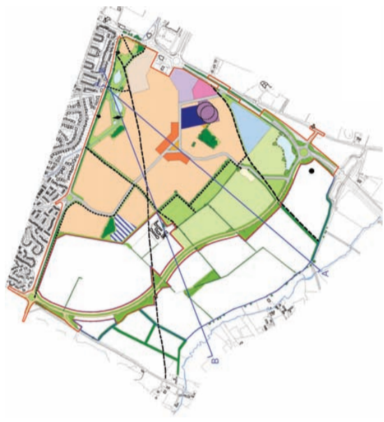
Section AA Scale 1: 2500 @ A1