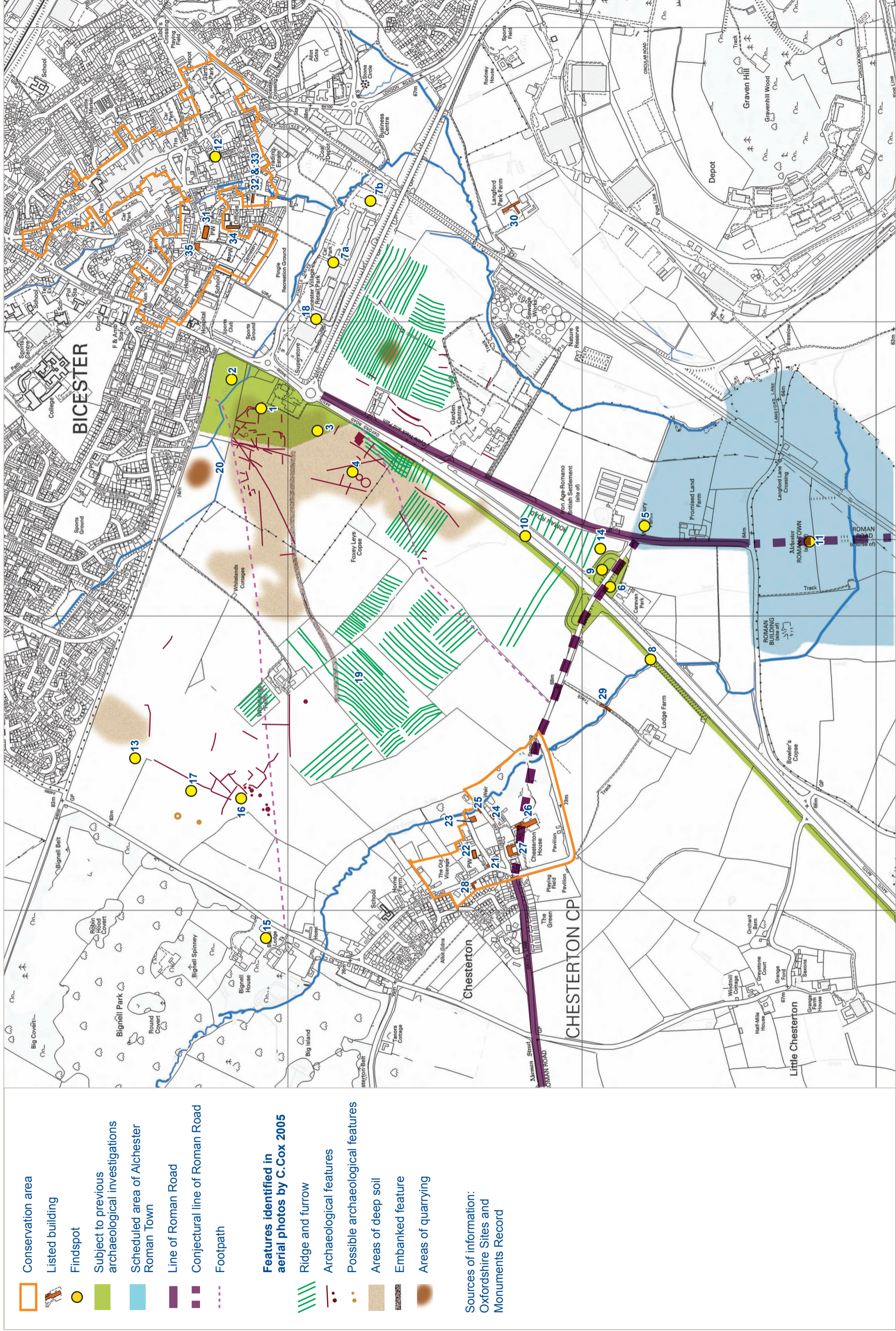
Figure 5.3 Plan of all the known cultural heritage sites and features in the vicinity