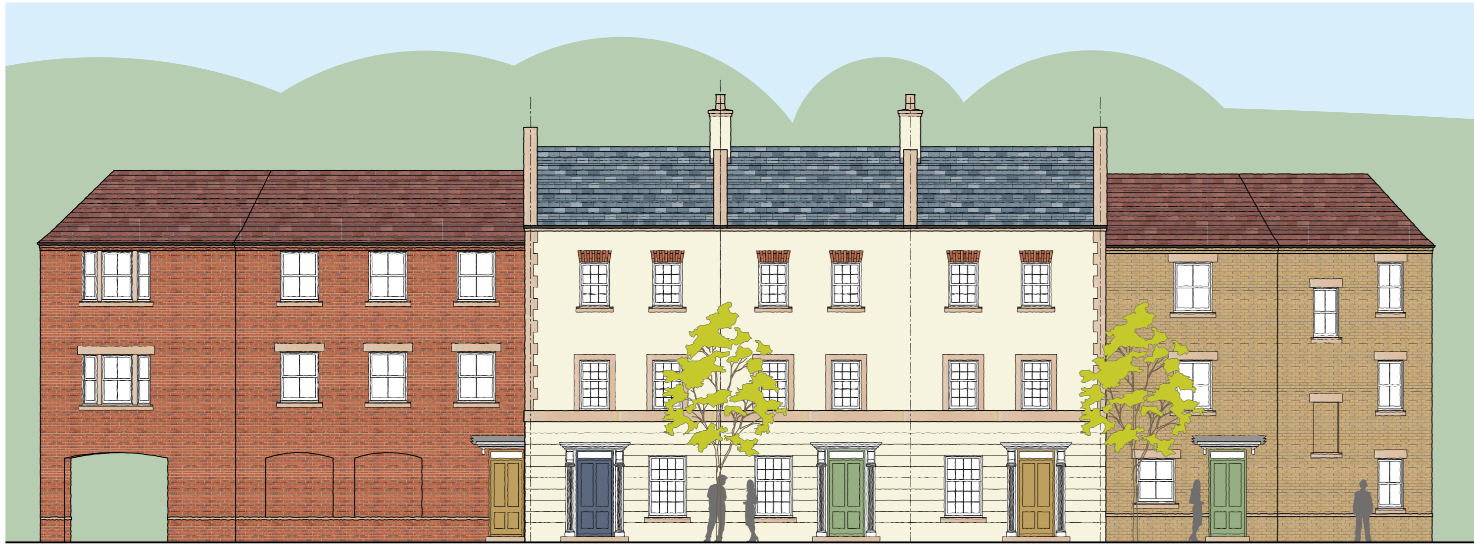
Front Elevation Scale 1:100 Plot 133 & 134 - Af2 & Af1 Flats Plot 135 - Af3b Plot 136 - Af3b Plot 137 - Af3b Plot 138 - Af4