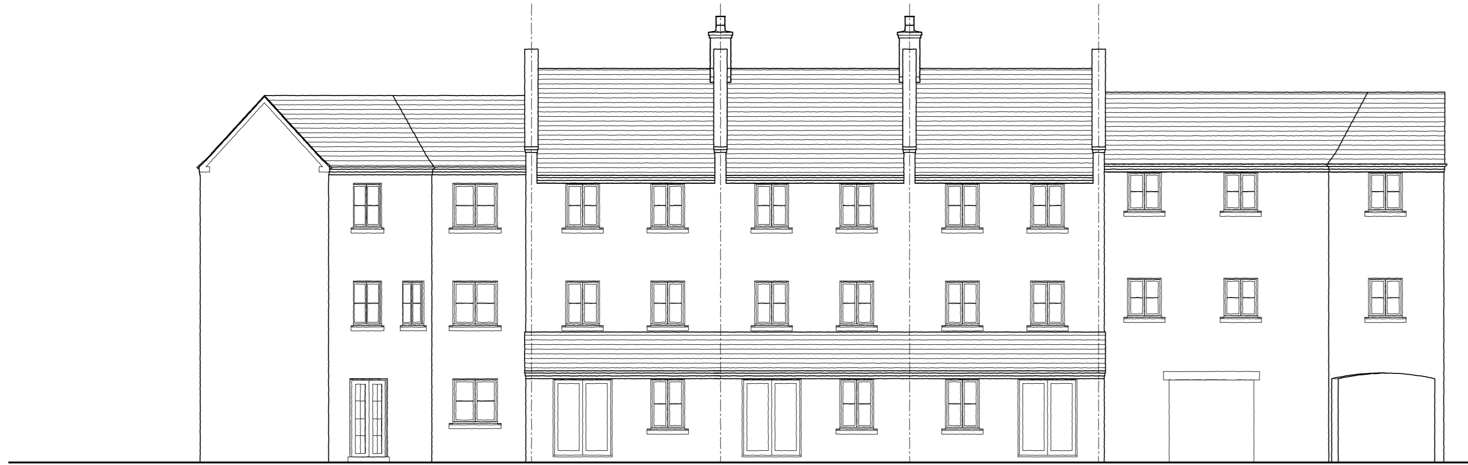
Rear Elevation Scale 1:100 Plot 138 - Af4 Plot 137 - Af3b Plot 136 - Af3b Plot 135 - Af3b Plot 133 & 134 - Af2 & Af1 Flats

NOTES CONTRACTORS MUST VERIFY ALL DIMENSIONS ON SITE BEFORE COMMENCING ANY WORK ON SHOP DRAWINGS DO NOT SCALE FROM THIS DRAWING MCBAINS COOPER CONSULTING LTD COPYRIGHT