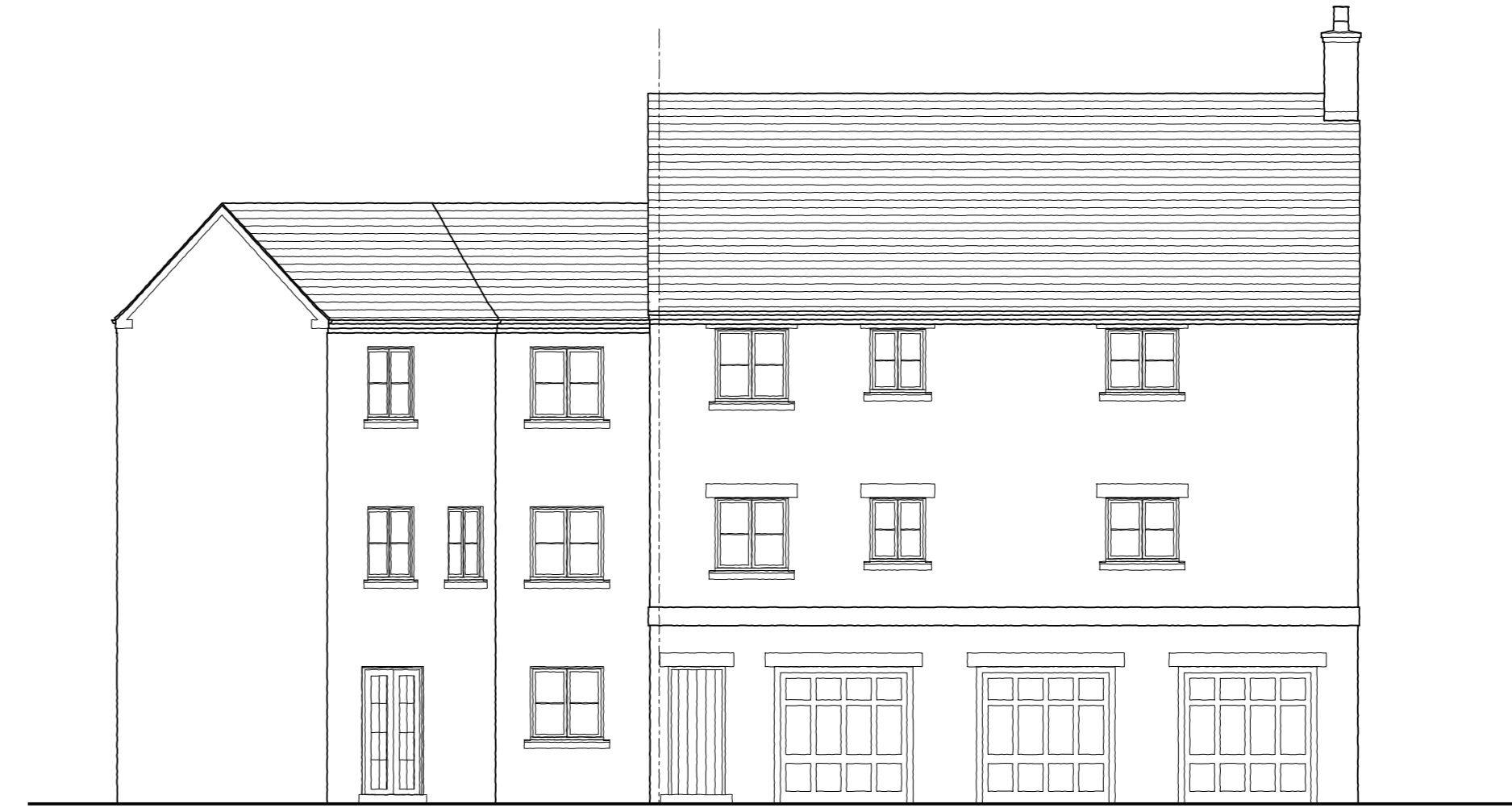
Rear Elevation Scale 1:100 Plot 141 - AF4 Plots 139 & 140 - AF1+AF2 FOG