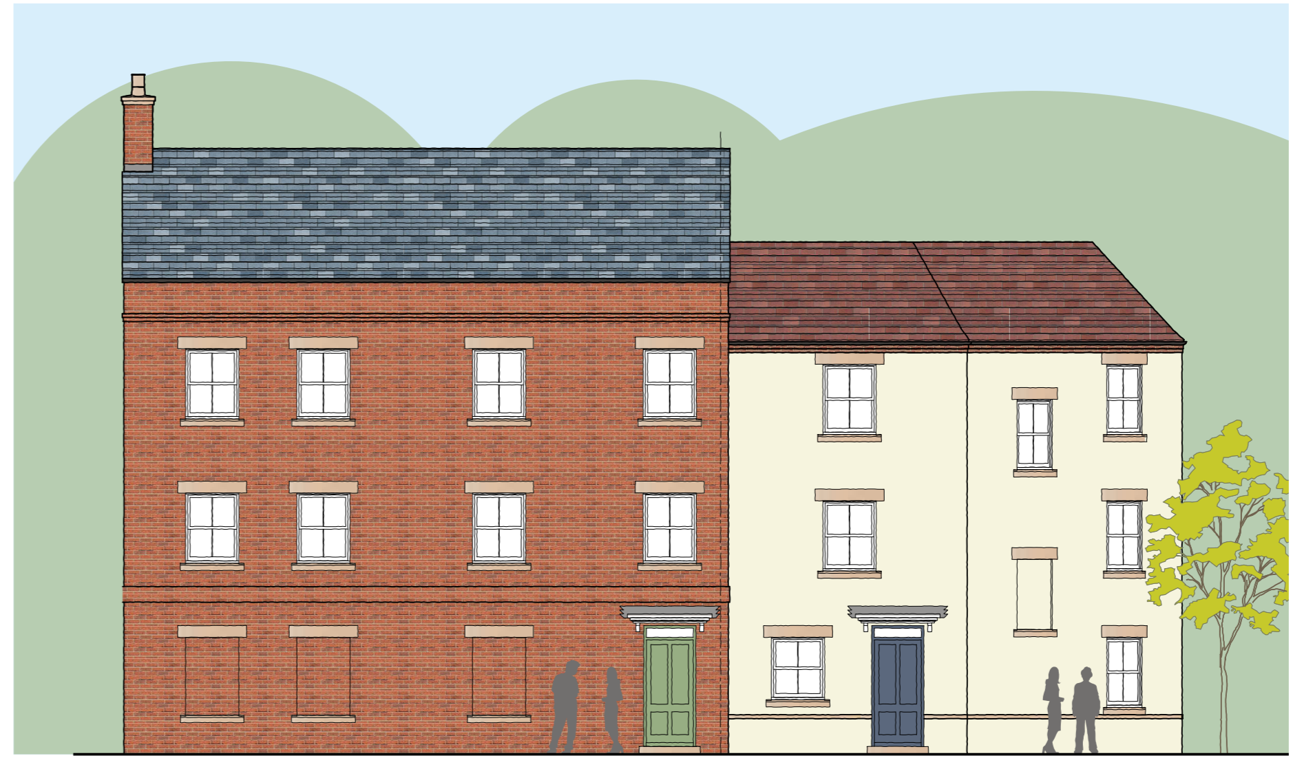
Front Elevation Scale 1:100 Plots 139 & 140 - AF1+AF2 FOG Plot 141 - AF4