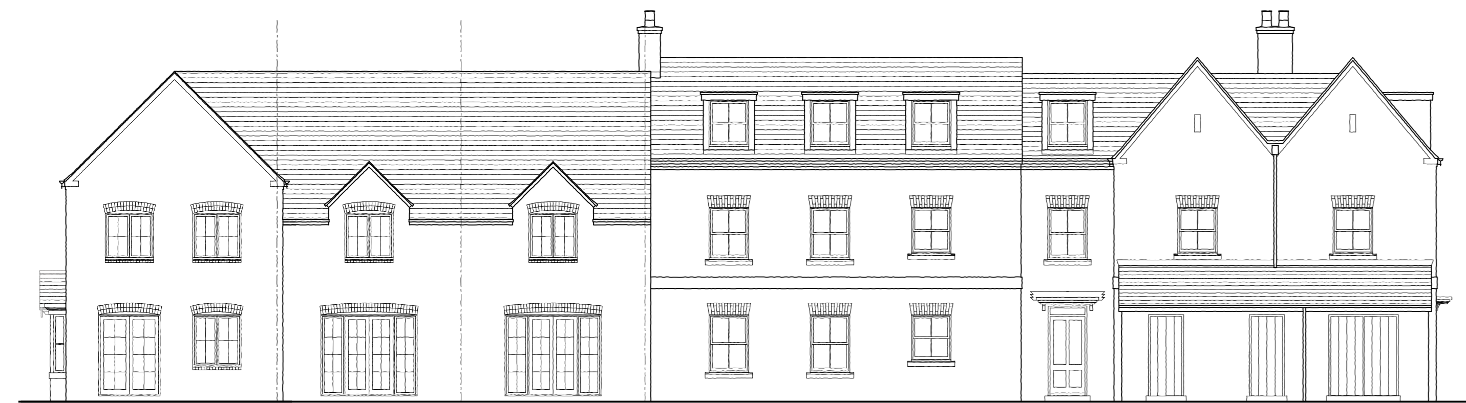
Plot 99 - Af3a Plot 100 - Af2 Plot 101 - Af2 Plot 102 - Af2 Flat Plot 103 - Af2 Flat Plot 104 - Af1 Flat Plot 105 & 106 - Af2 Flats Plot 107 - Af1 Flat Rear Elevation Scale 1:100