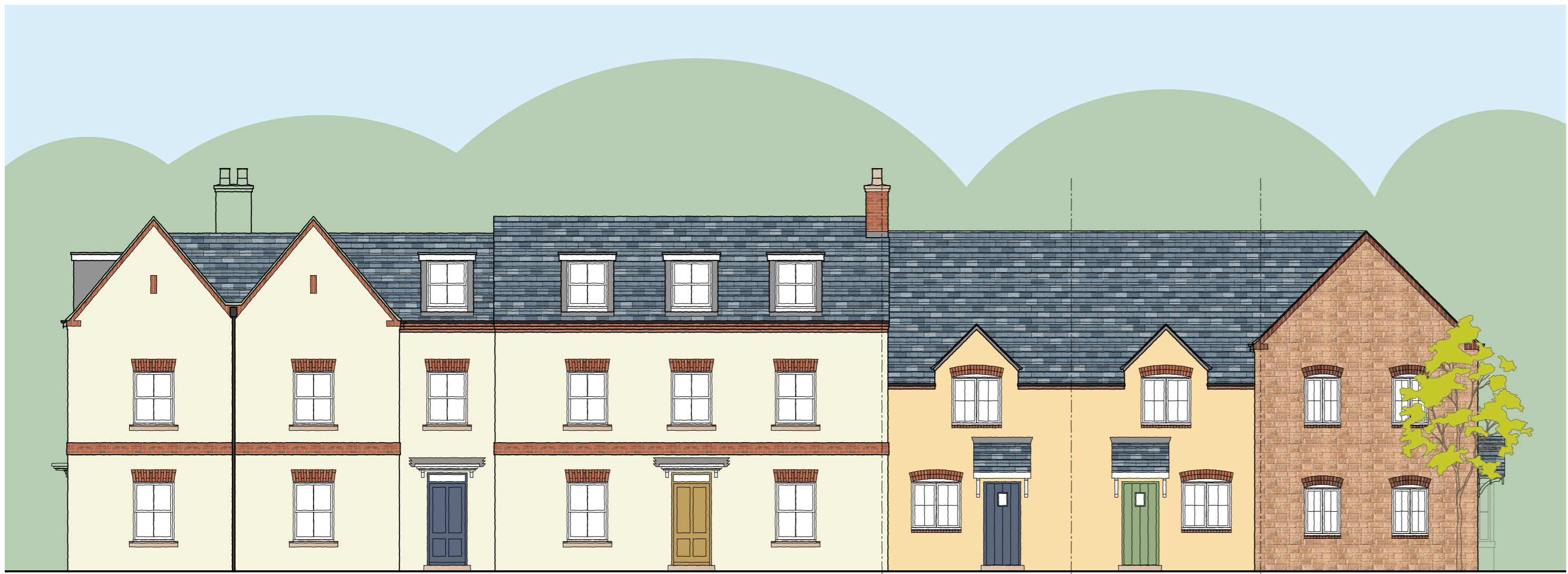
Plot 107 - Af1 Flat Plot 105 & 106 - Af2 Flats Plot 104 - Af1 Flat Plot 103 - Af2 Flat Plot 102 - Af2 Flat Plot 101 - Af2 Plot 100 - Af2 Plot 99 - Af3a Front Elevation Scale 1:100

NOTES CONTRACTORS MUST VERIFY ALL DIMENSIONS ON SITE BEFORE COMMENCING ANY WORK ON SHOP DRAWINGS DO NOT SCALE FROM THIS DRAWING MCBAINS COOPER CONSULTING LTD COPYRIGHT