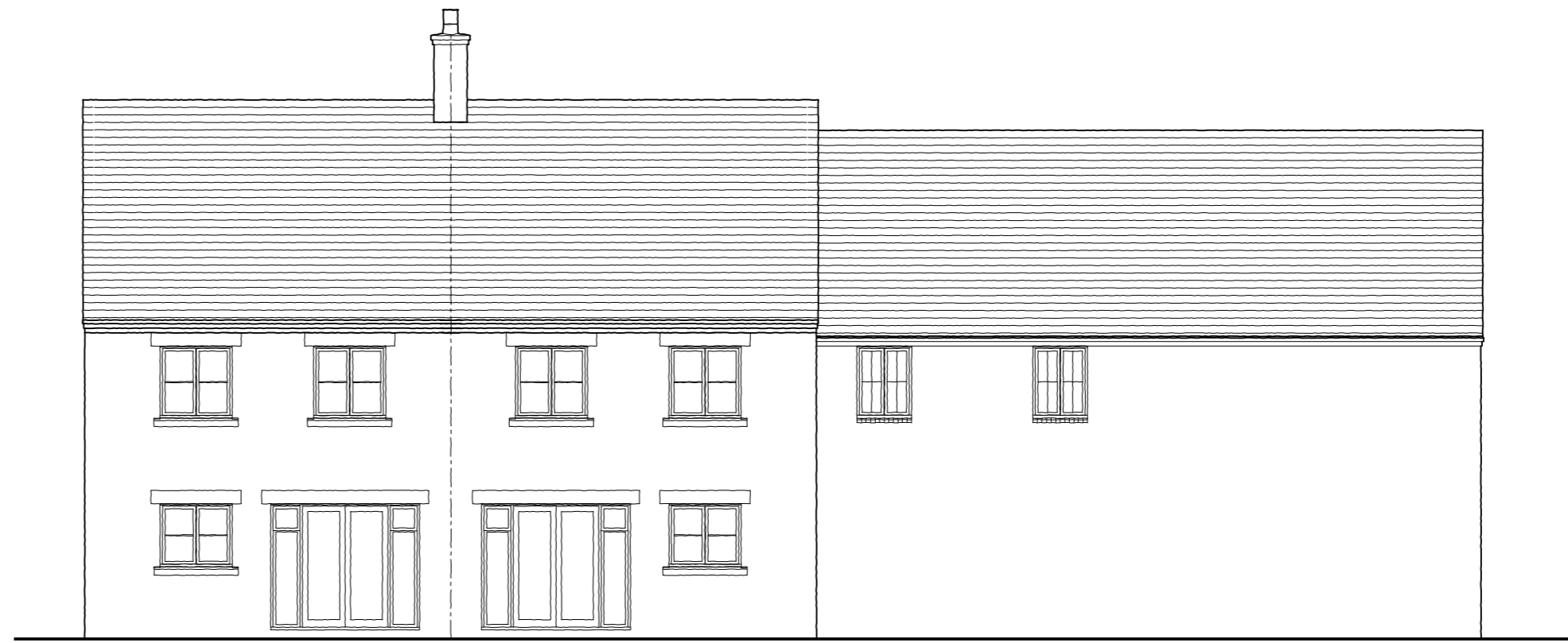
Plot 118 - KM1 Plot 119 - KM1 Plot 120 - Oxford 2 Rear Elevation Scale 1:100