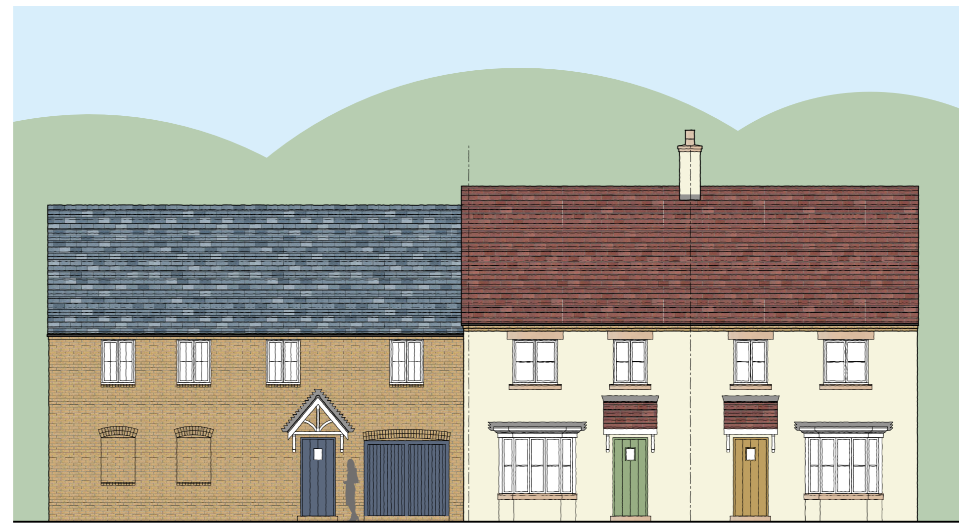
Plot 120 - Oxford 2 Plot 119 - KM1 Plot 118 - KM1 Front Elevation Scale 1:100