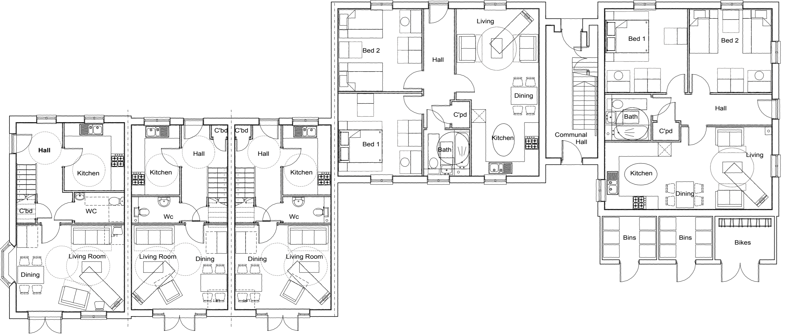
Plot 99 - Af3a Plot 100 - Af2 Plot 101 - Af2 Plot 102 - Af2 Flat Plot 103 - Af2 Flat Plot 104 - Af1 Flat Plot 105 & 106 - Af2 Flats Plot 107 - Af1 Flat Ground Floor Plan Scale 1:100