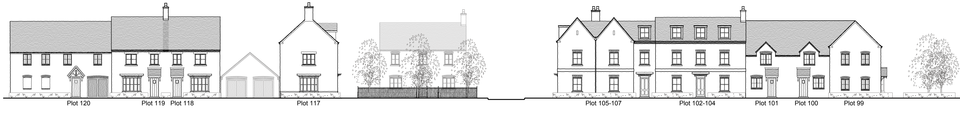
1 SECTION M Scale 1:200

NOTE: ELEVATIONS DEVELOPED ALONG STREET EDGE