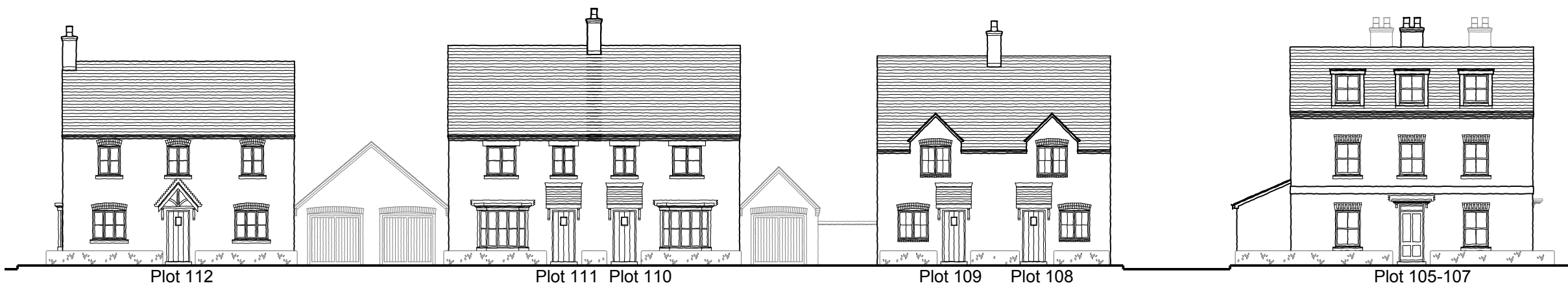
2 SECTION N Scale 1:200