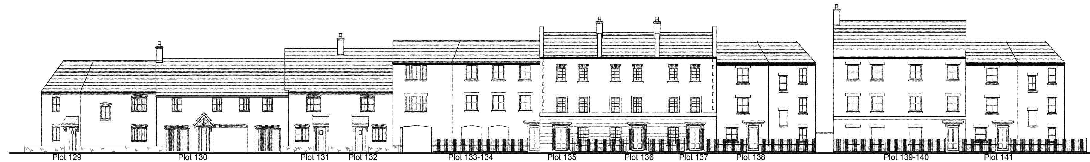
4 SECTION P Scale 1:200

NOTE: ALL BATHROOMS, CLOAKROOMS & ENSUITE WINDOWS TO HAVE OBSCURED GLASS. REFER TO EXTERNAL MATERIALS PLAN FOR SPECIFIC MATERIALS AND COLOURS.