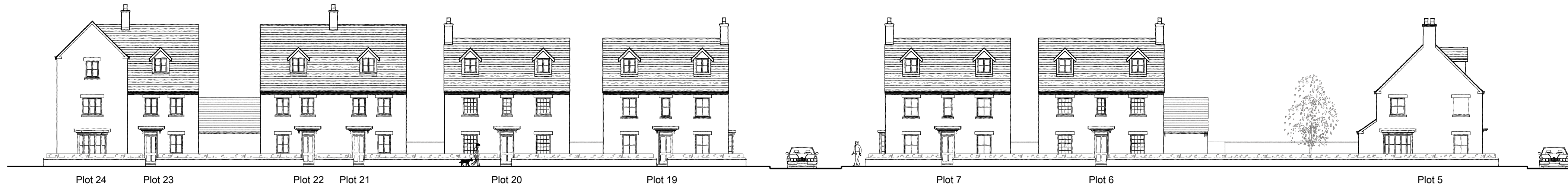
2 SECTION B Scale 1:200