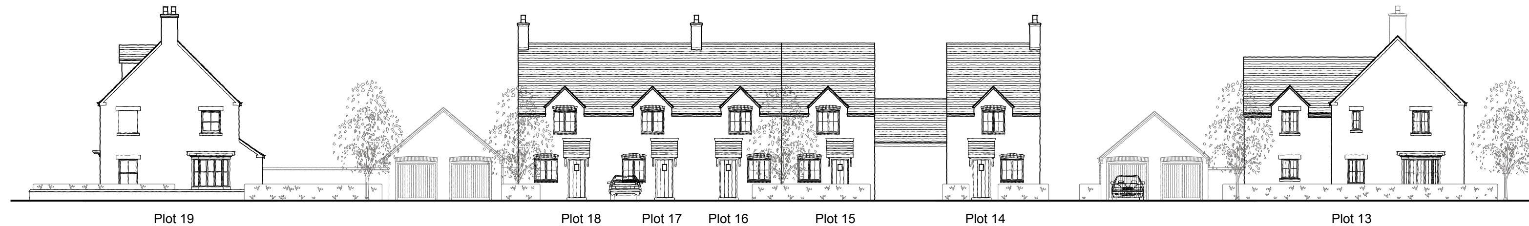
3 SECTION C Scale 1:200