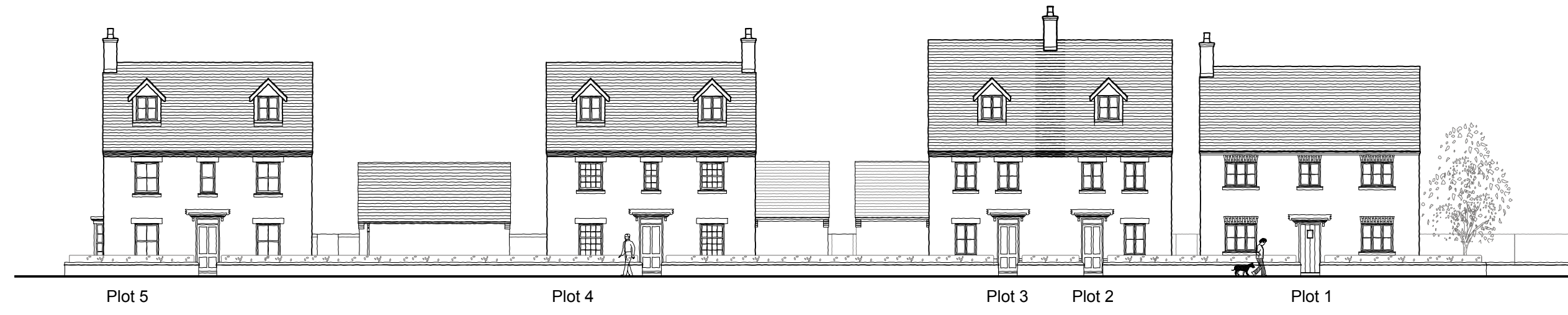
1 SECTION A Scale 1:200

NOTE: ELEVATIONS DEVELOPED ALONG STREET EDGE