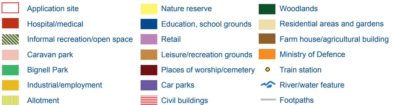
Figure 2.2 Site characteristics and context