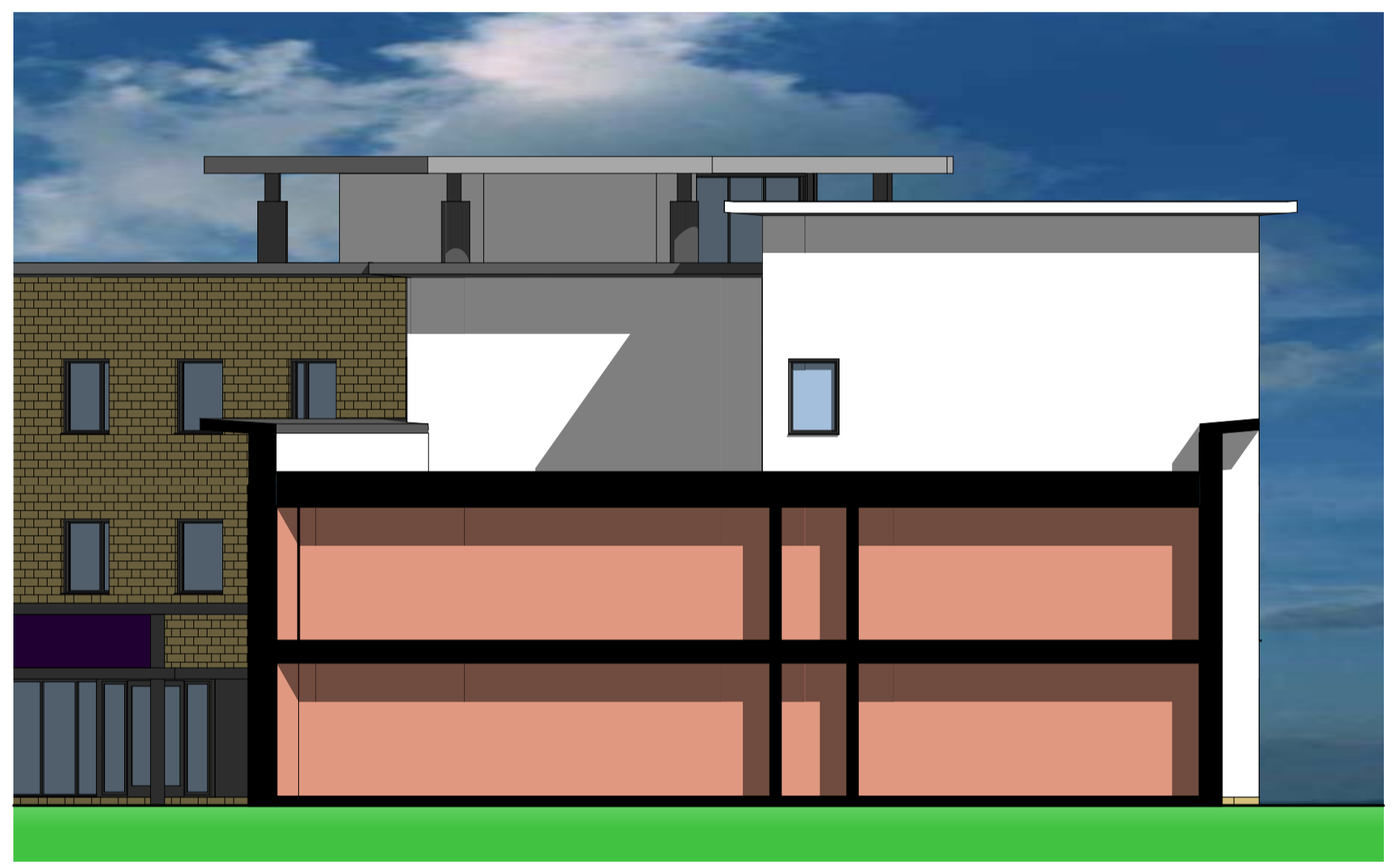
North Sectional Elevation