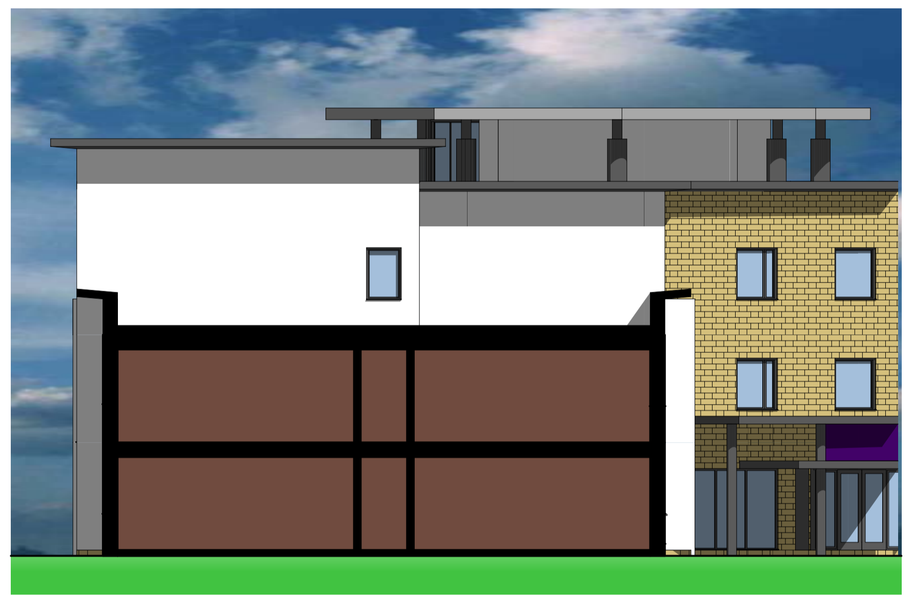
North East Sectional Elevation