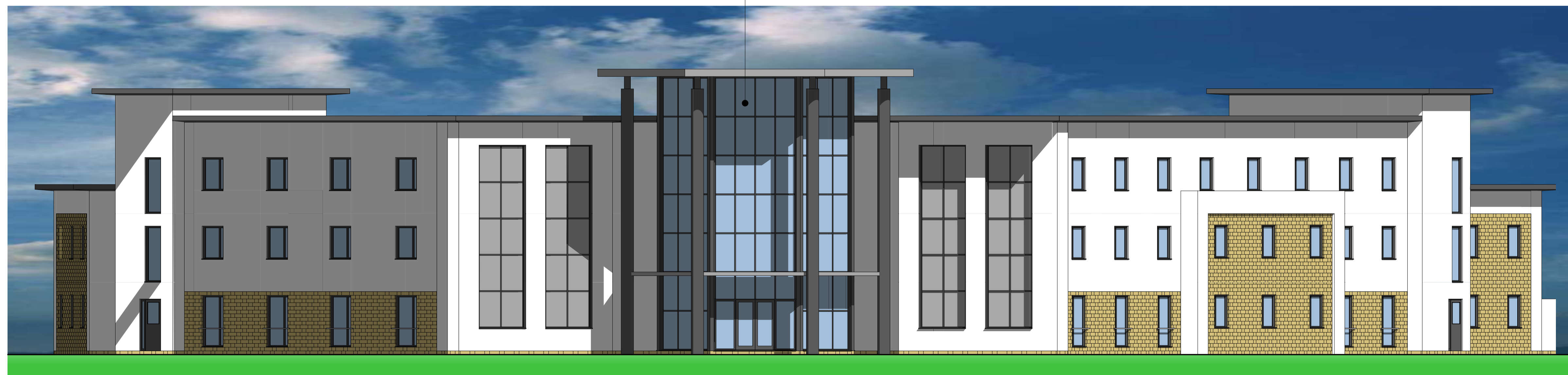
South Elevation (A41 Junction)