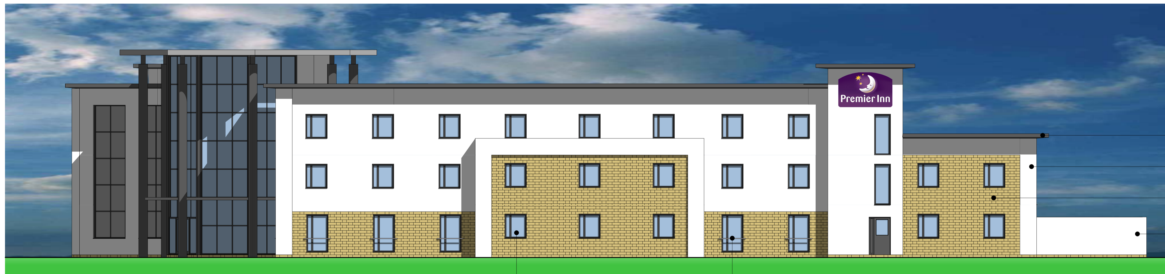
South East Elevation (A41)