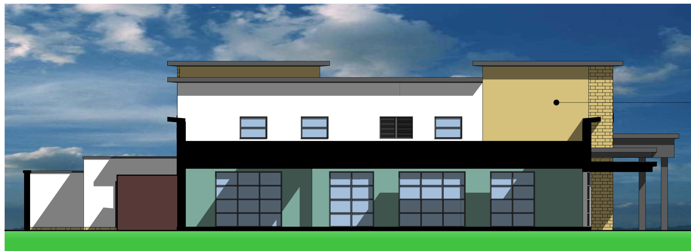
North West Sectional Elevation (elevation to flat roof)

Walls above roof level to be render to match stone colour