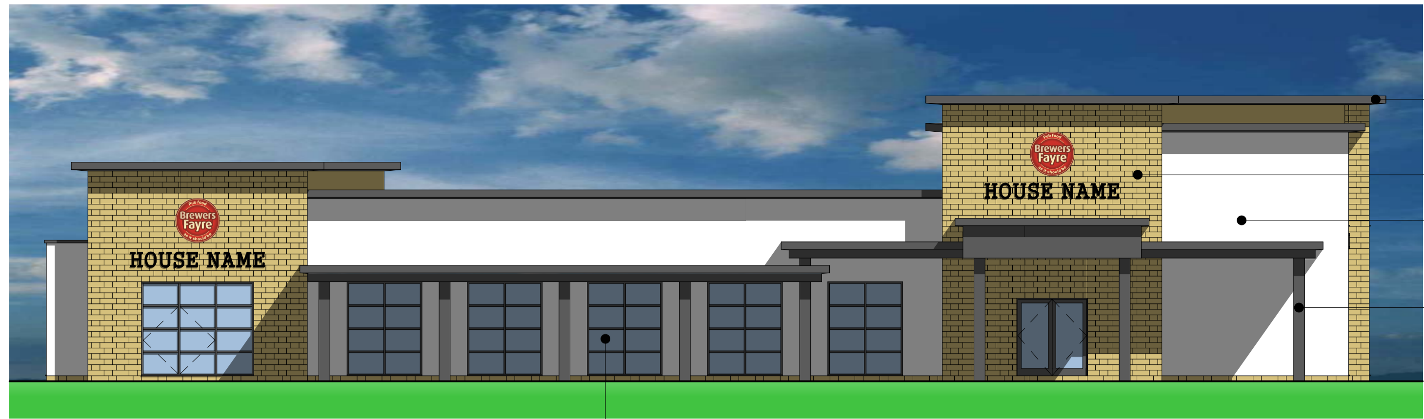
South West Elevation (front)

Windows & Doors finished in RAL 7024 (graphite grey)