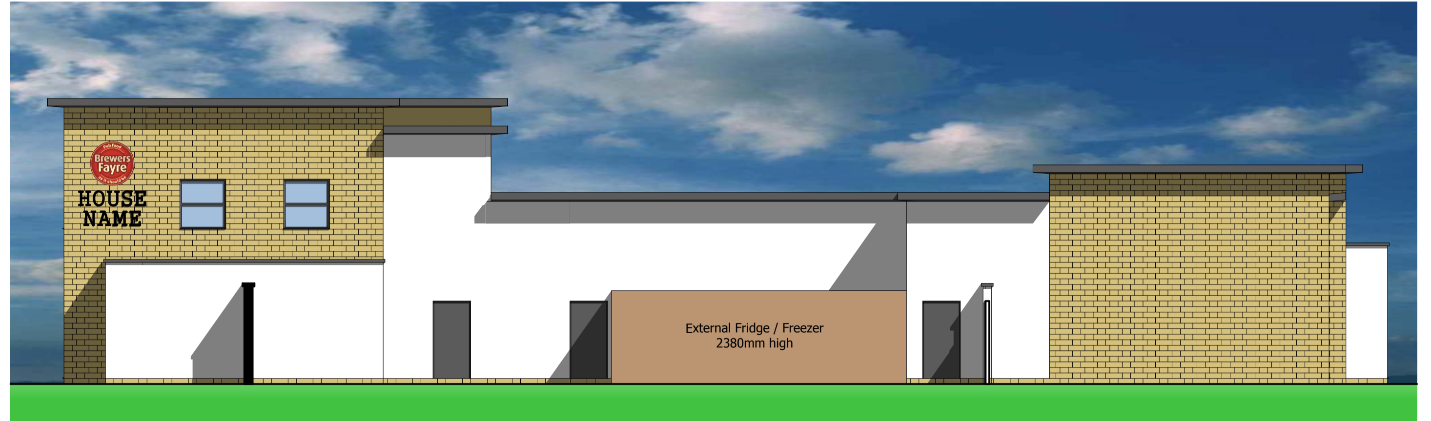
North East Elevation (through yard)