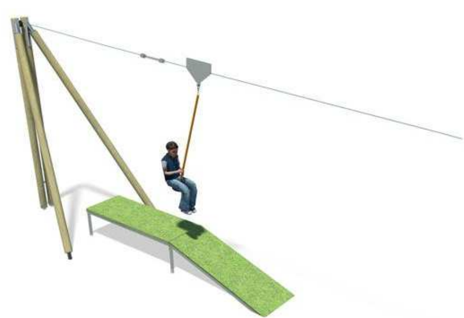
3 Playdale Aerial Runway 25 metre length Product Code AERL