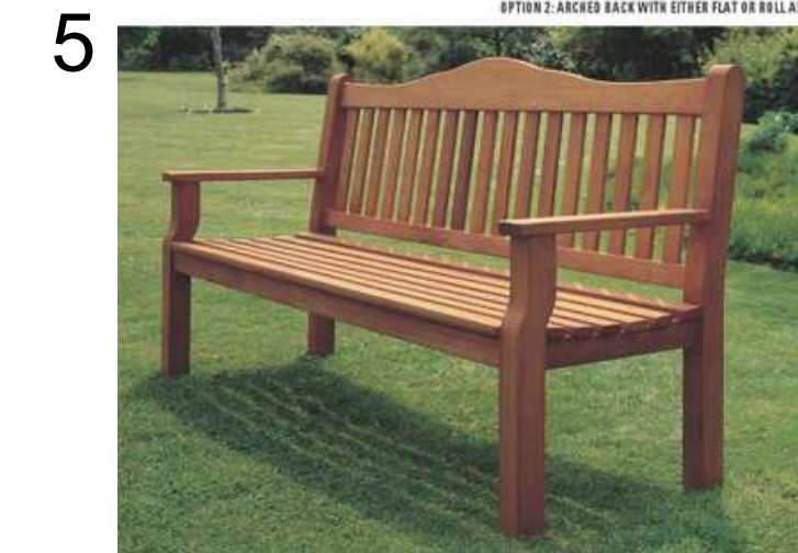
5 Iroka traditional arched bench with flat arms