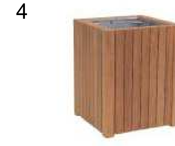
4 Iroka Woolbrook Litter bin

Benches and Litter Bins Orchard Street Furniture tel:- 01491 642123 email:- sales@orchardstreet.co.uk www.orchardstreet.co.uk