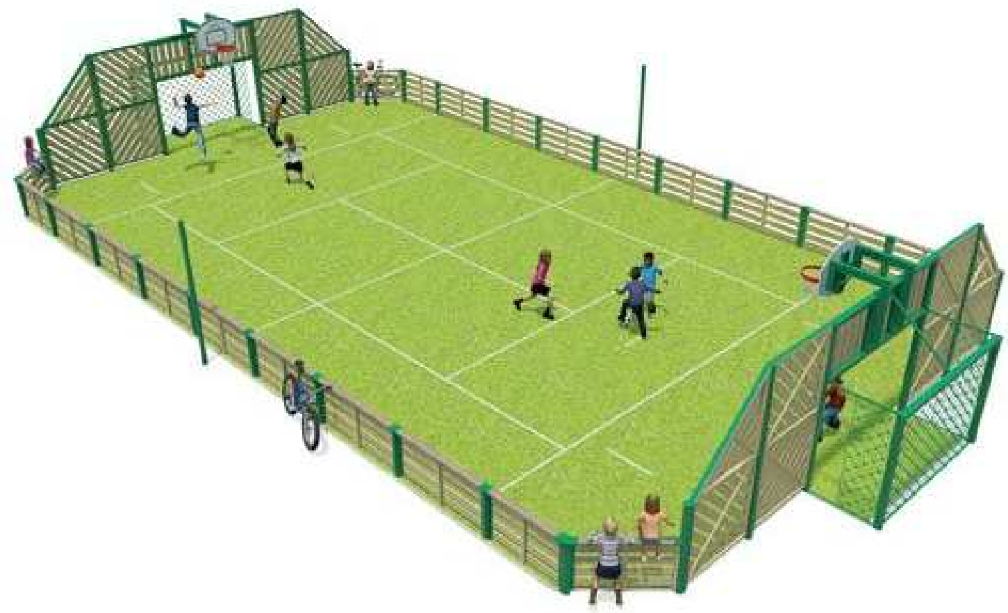
1 Playdale MUGA and mini Pitches type Classic in green wood Product Code 3000 AE