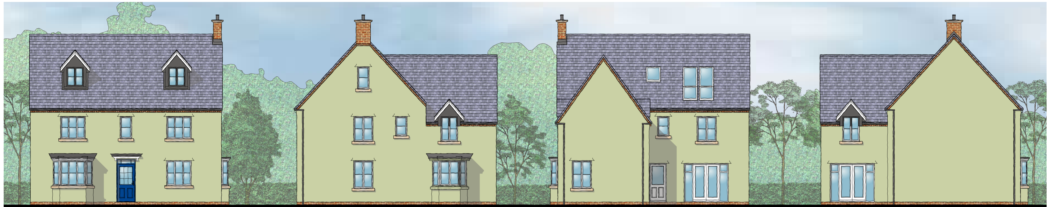
FRONT ELEVATION H536