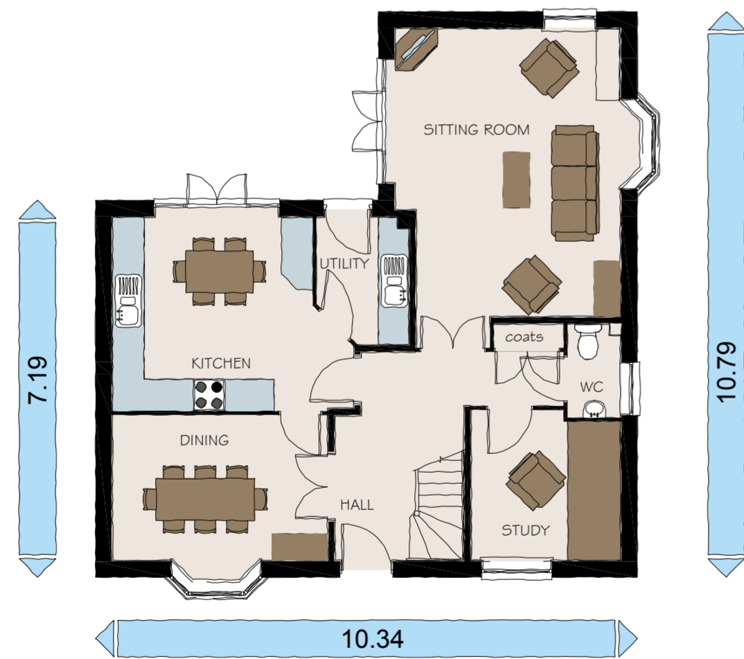
GROUND FLOOR PLAN H500