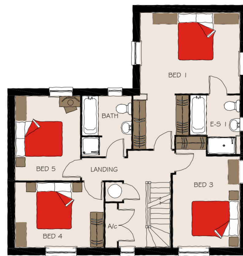
FIRST FLOOR PLAN H500