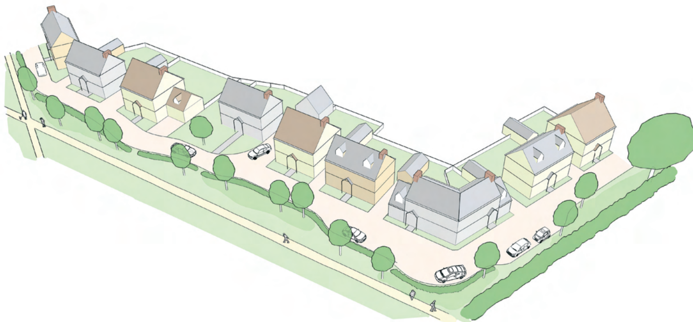
Figure 4.10 Whitelands character area is characterised by green streets where informal front gardens, soft verges and prominent trees dominate the streetscene. The indicative view above shows a perforated rural edge overlooked by detached and paired buildings. Location of sketch shown below.