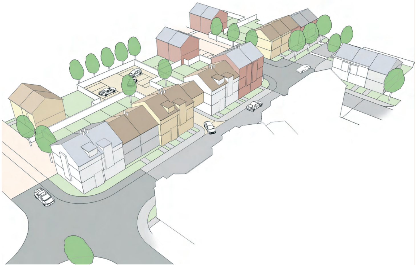
Figure 4.7 The Urban Village character area is characterised by enclosed streets lined with a mixture of building types and styles. The indicative view above shows a regular street grid of terraced units with concealed parking. Location of sketch is shown below.