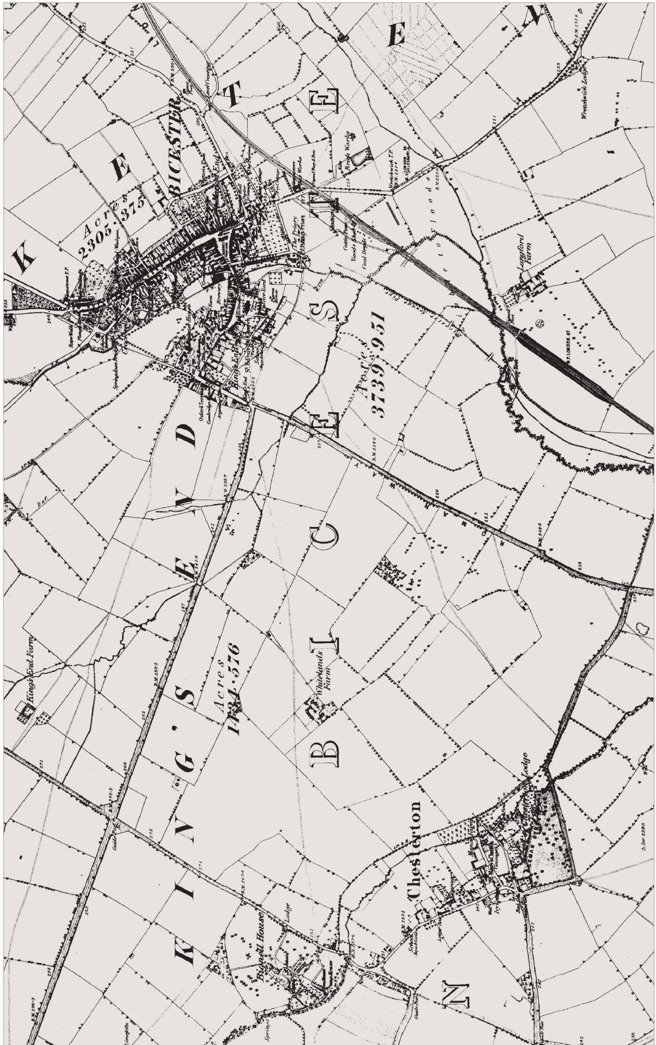
Figure 5.10 Ordnance Survey first edition county series map of the site dated 1885