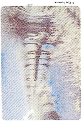
River Thame and old postroads