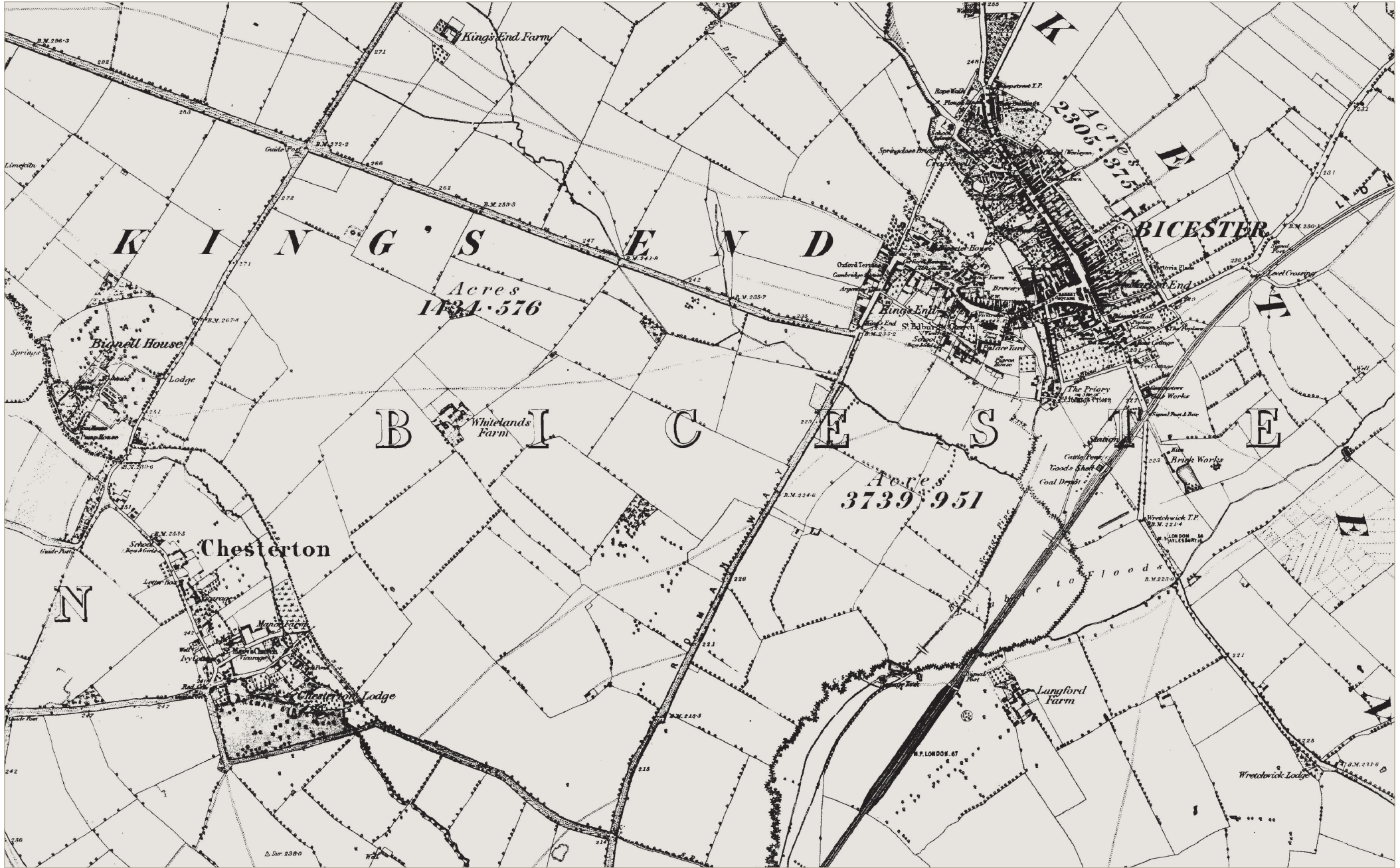
Appendix 3 Ordnance Survey first edition county series map of 1885