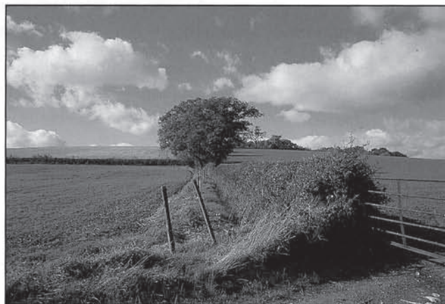
Large geometrically spaced fields divided by a regular pattern of hedgerows and hedgerow trees supporting both arable and pastoral farming.

The landscape is made up of woods and arable fields interspersed by numerous distinctive small villages. Woodland cover tends to be most extensive along the Corallian Limestone ridge in Oxfordshire while, in contrast, the Portland Limestone hills of Buckinghamshire have few large woods. Here, isolated trees and small woodlands are more typical. Fields are typically defined by a regular pattern of hedgerows and trees that enclose characteristically large and geometrically spaced fields.