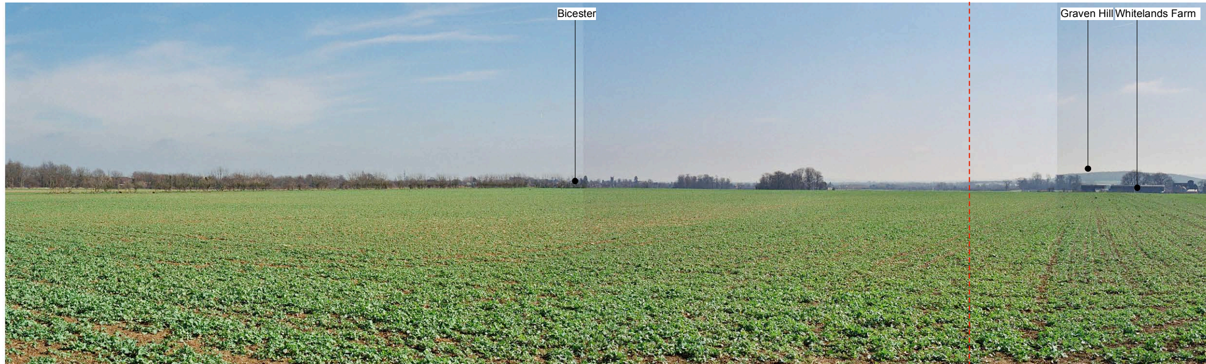
Winter View 13 - From the western boundary of the site adjacent to the A4095 looking east towards Whitelands Farm and Bicester.