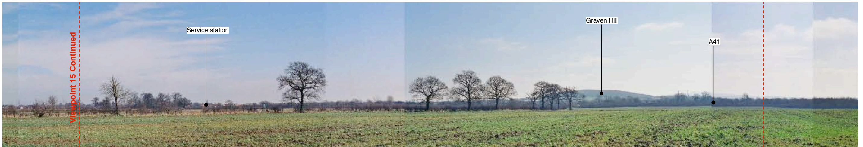
View 15 - Panoramic view from central location within the site.