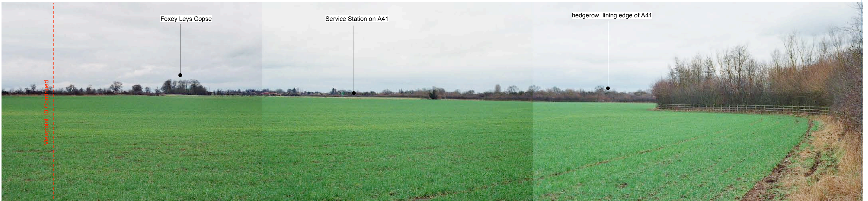
View 14 - From southern boundary of the site looking west & north towards Whitelands Farm and Bicester.