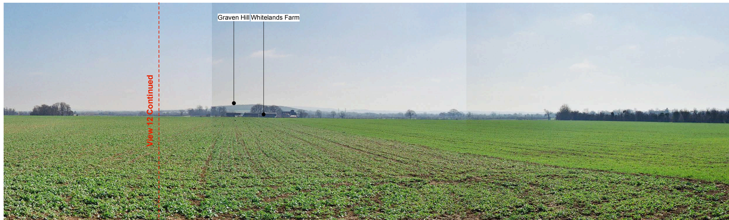
Winter View 13 - Continued from the western boundary of site adjacent to the A4095 looking east towards Whitelands Farm and Graven Hill.