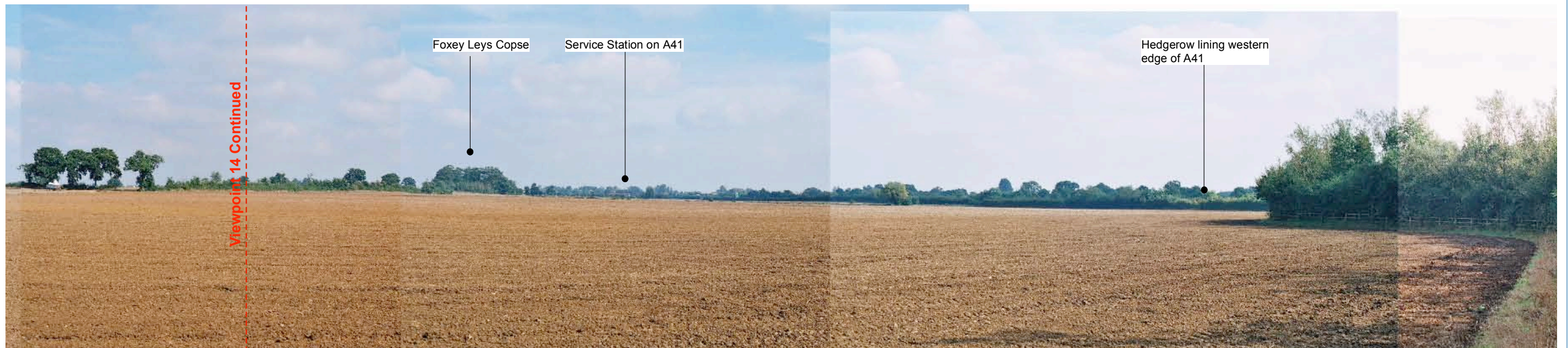
View 14 - Panoramic view from southern boundary of the site looking west & north towards Whitelands Farm and Bicester.