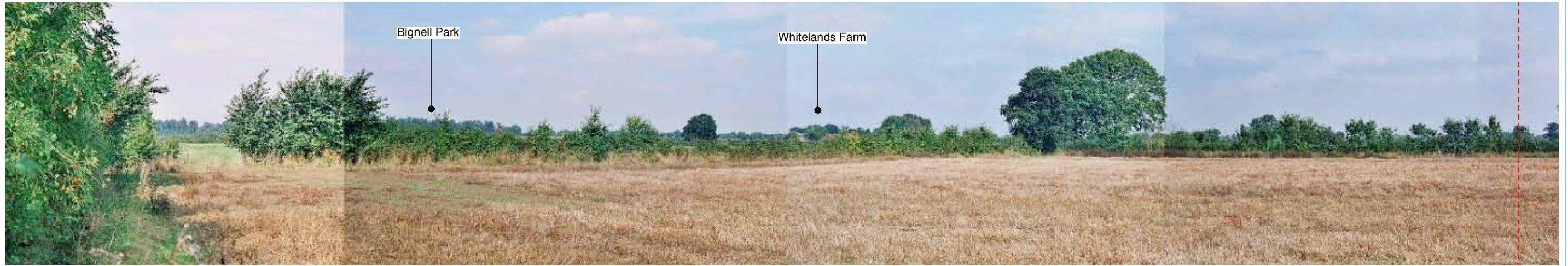
Summer View 15 - Panoramic view from central location within the site.