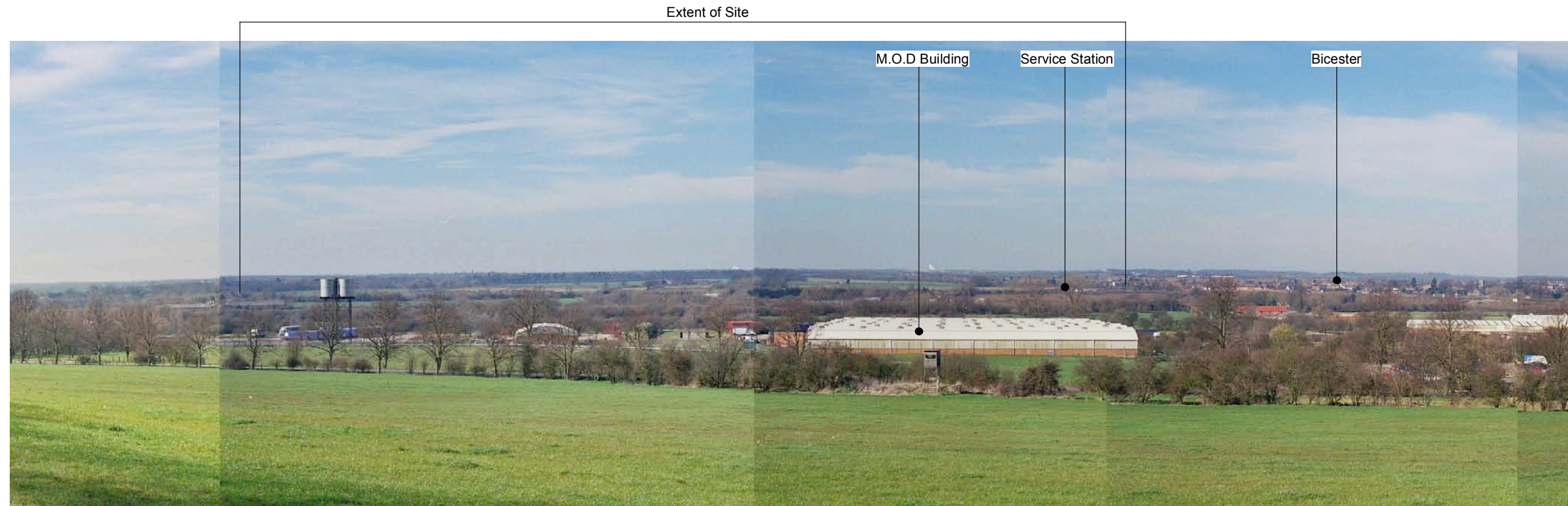
Winter View 11 - From Graven Hill looking north west towards the site and Bicester.