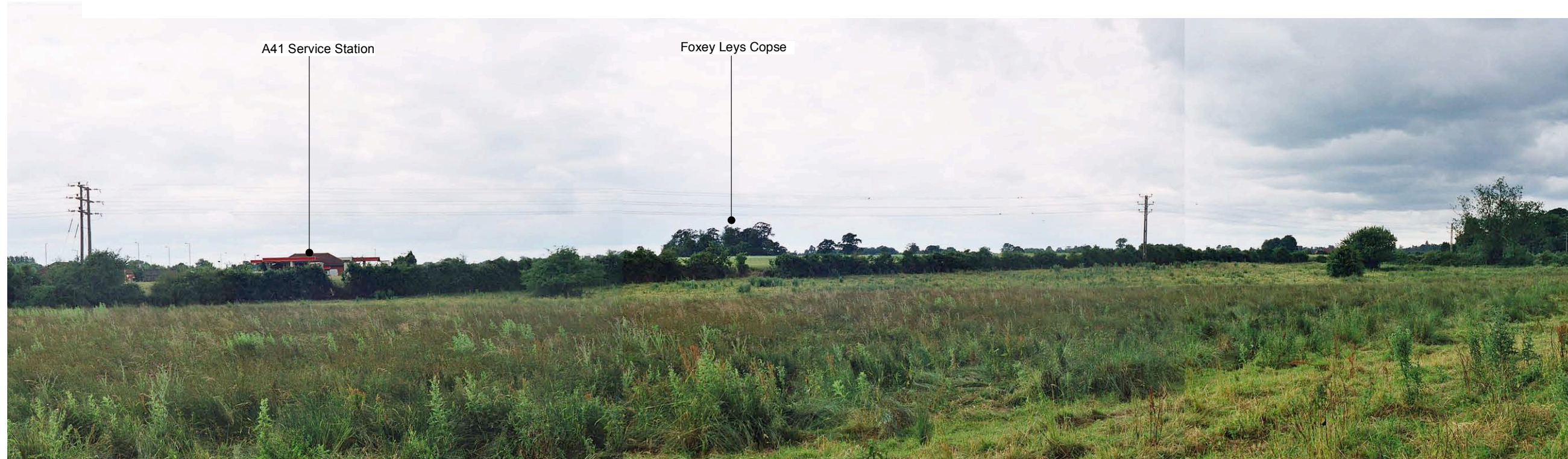
View 10 - From the eastern corner of the site looking south west across Pingle Brook, towards Whitelands Farm and the service station.