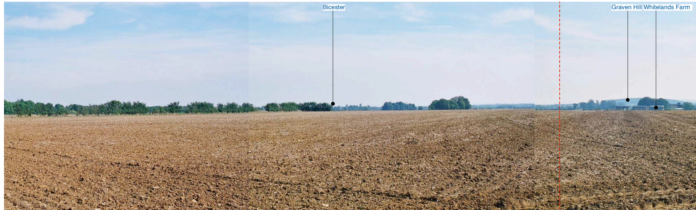
Summer View 13 - From the western boundary of the site adjacent to the A4095 looking east towards Whitelands Farm