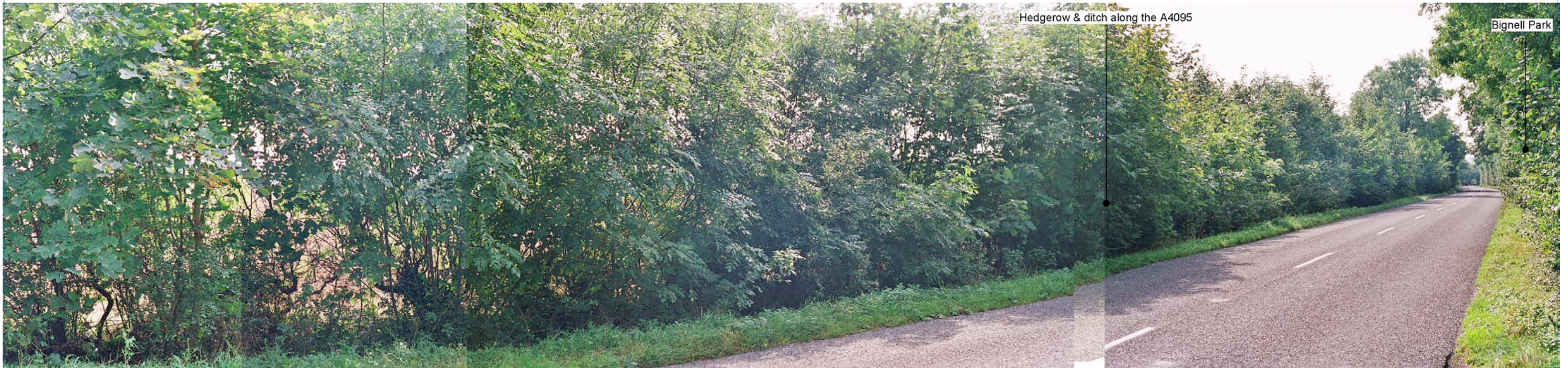
Winter View 18 - From A4095 looking south east towards the site.