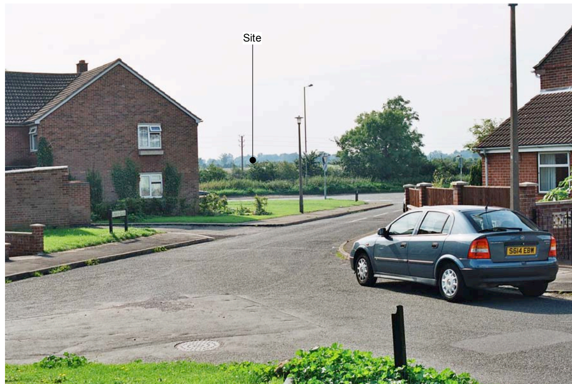
View 16 - From the southern edge of Bicester town looking south west towards the site.