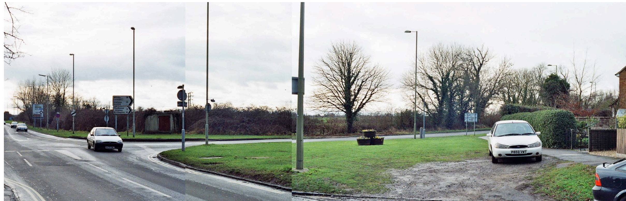
Winter View 12 - From pavement on Kings End, looking south west towards one edge of the site.