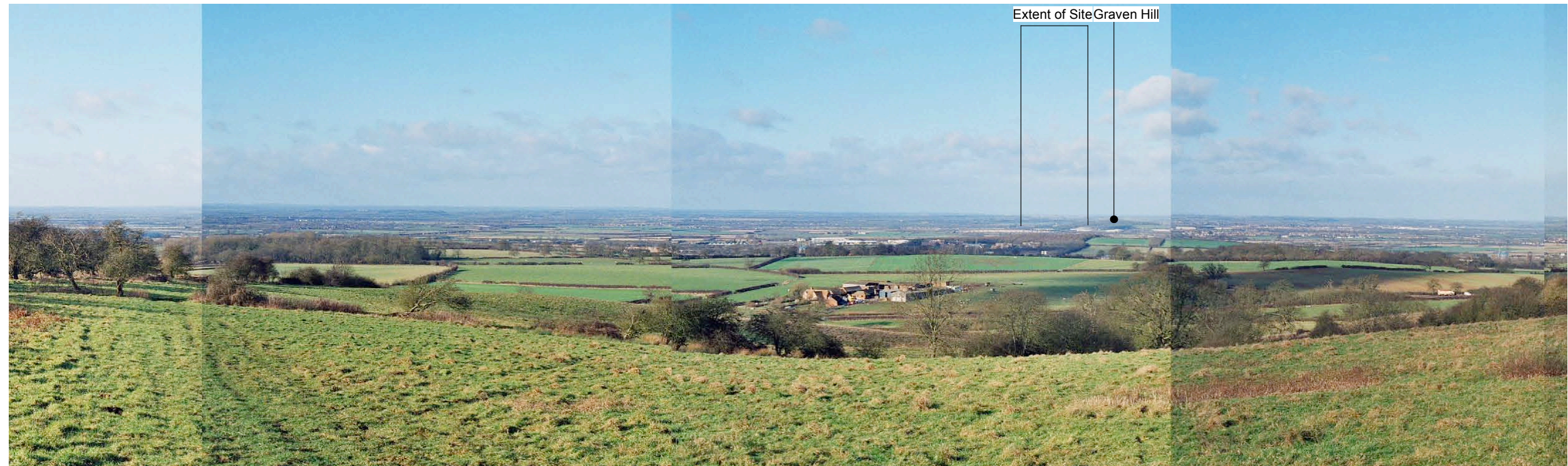
Winter View 3 - From Public Right of Way south of Middle Farm on Muswell Hill looking north west towards the site and Bicester.