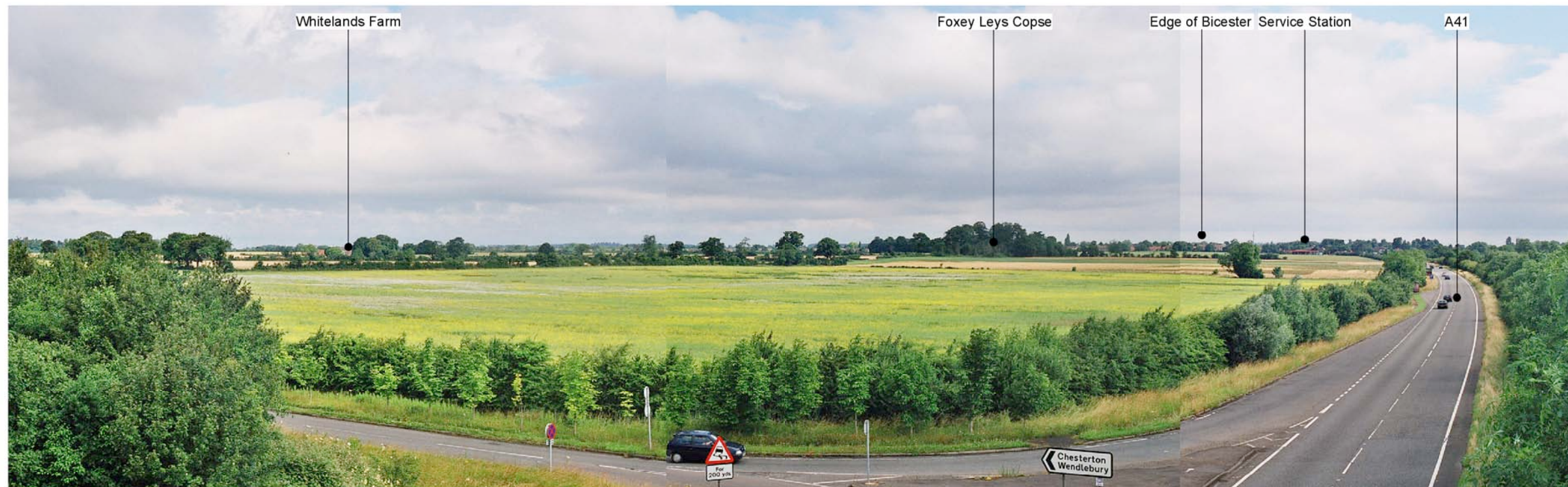
View 1 - From the flyover on the A41 near junction to Chesterton looking north across the site towards Bicester.