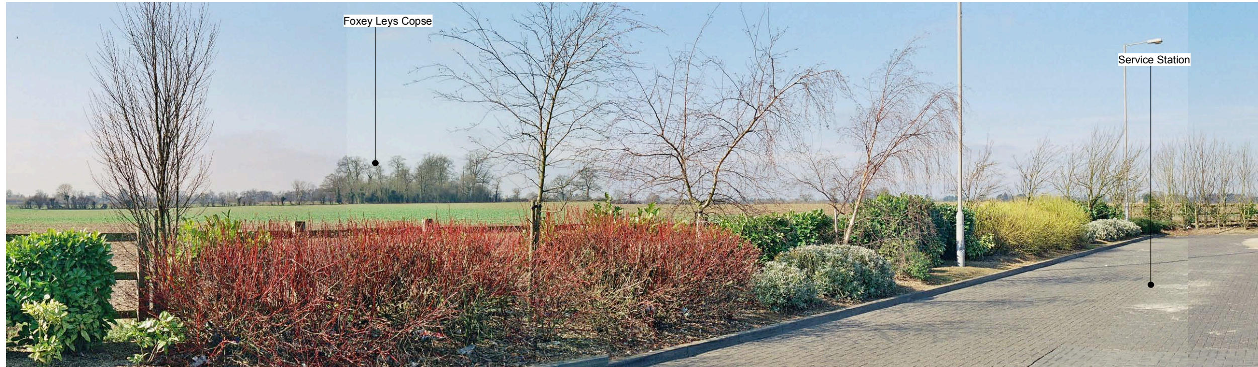
Winter View 7 - From the A41 Service Station looking south west towards Whitelands Farm.