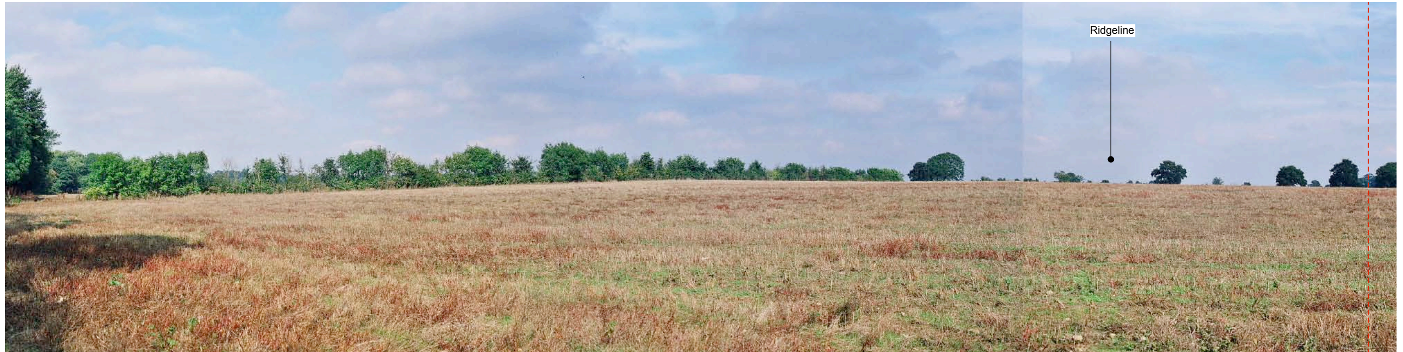
Summer View 6 - Panoramic view from the southern boundary of the site by lay-by looking north towards Whitelands Farm and Bicester.