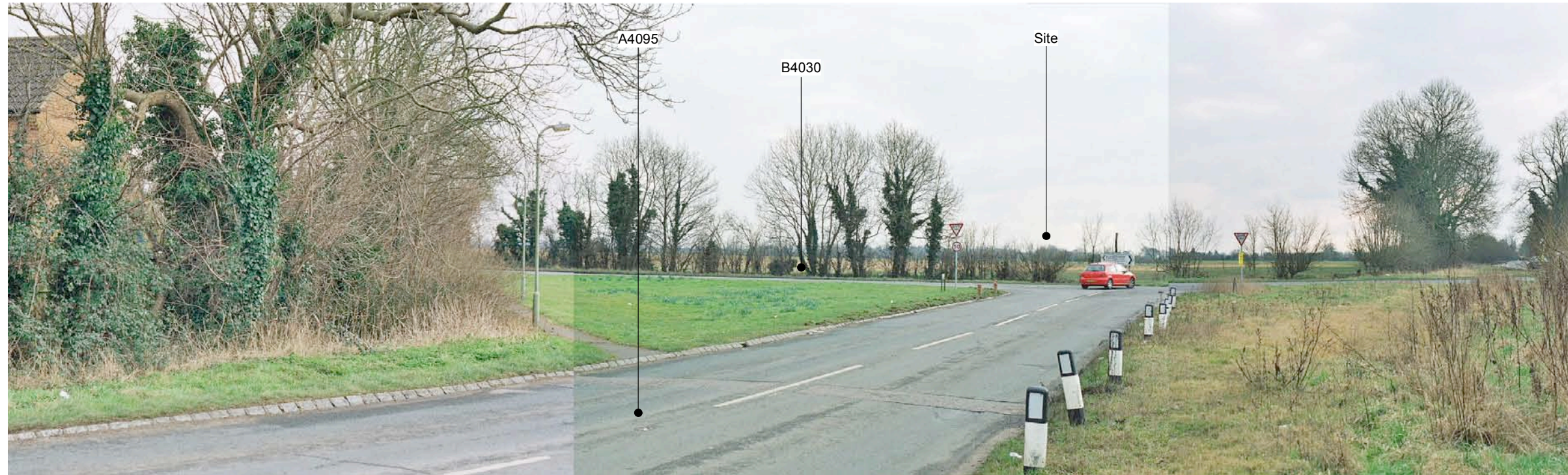
Winter View 2 - From the A4095 looking south west towards the junction with B4030 and north western corner of the site.