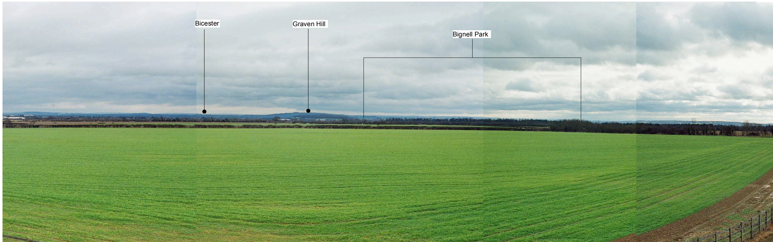
View 8 - From Alchester Road looking across Chesterton School looking north towards the site.