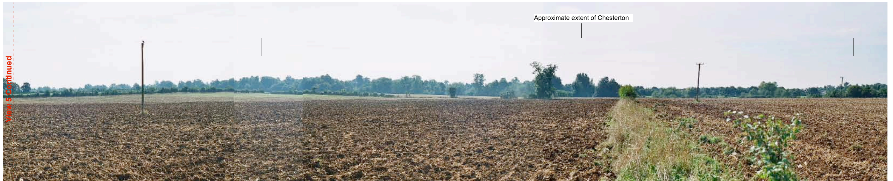
View 5 - Panoramic view from Public Right of Way looking towards Whitelands Farm & Chesterton.