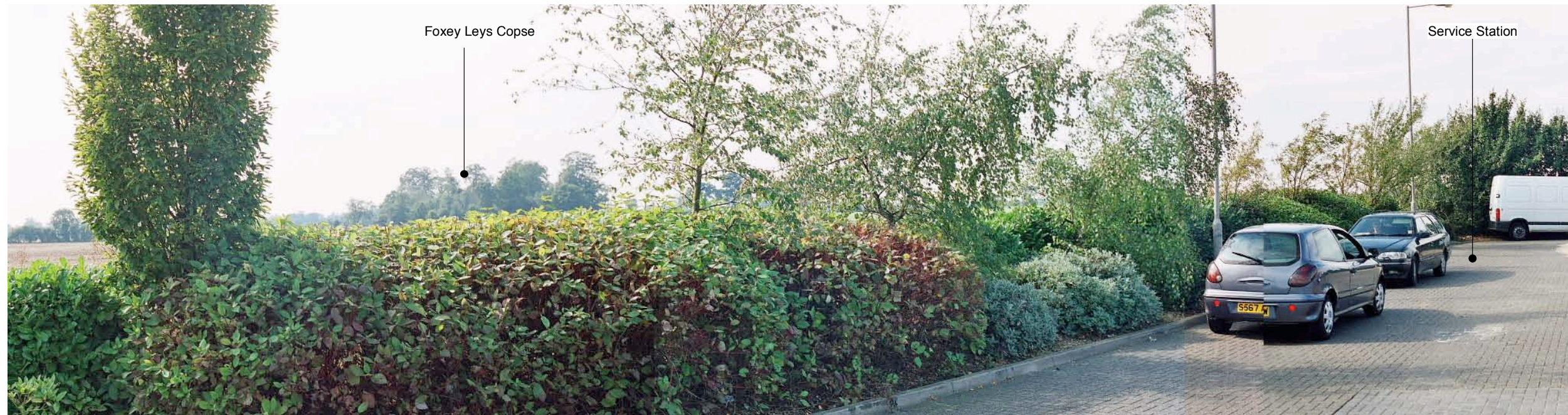
Summer View 7 - From the A41 Service Station looking south west towards Whitelands Farm.