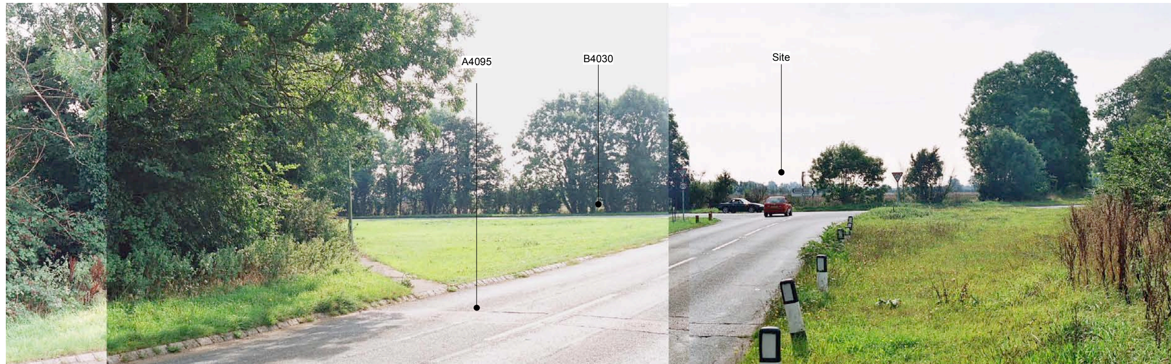
Summer View 2 - From the A4095 looking south west towards the junction with B4030 and north western corner of the site.