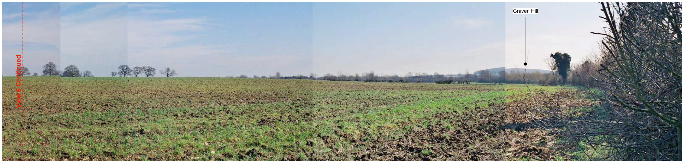
View 6 - Panoramic view from the southern boundary of the site by lay-by looking north towards Whitelands Farm and Bicester.