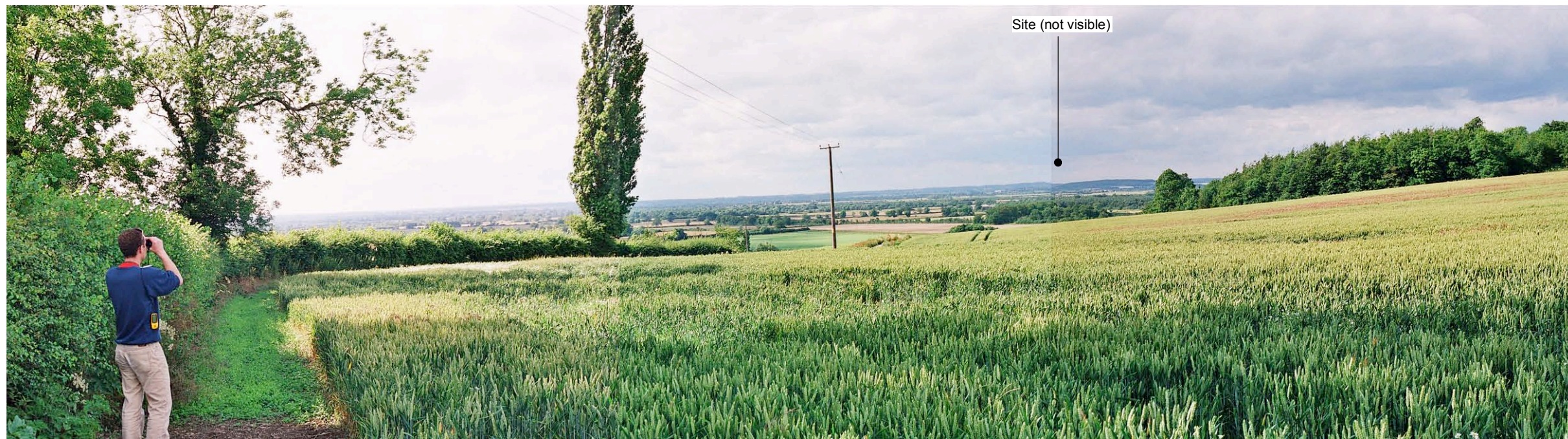
View 4 - View looking north west towards the site and Bicester from Public Right of Way south of Gardener's Barn in Horton-Cum-Studley.