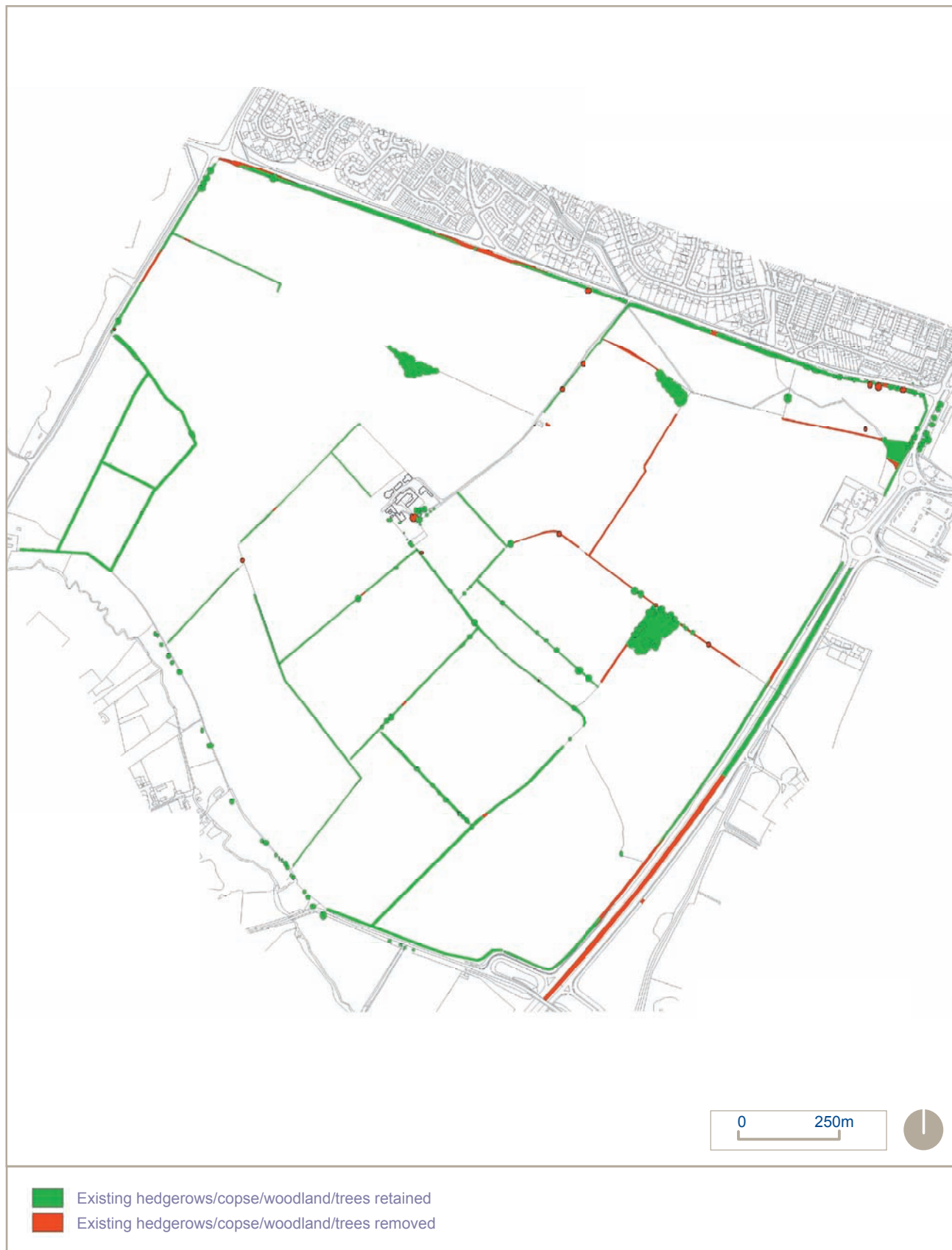
Figure NTS 7 Tree removal and retention