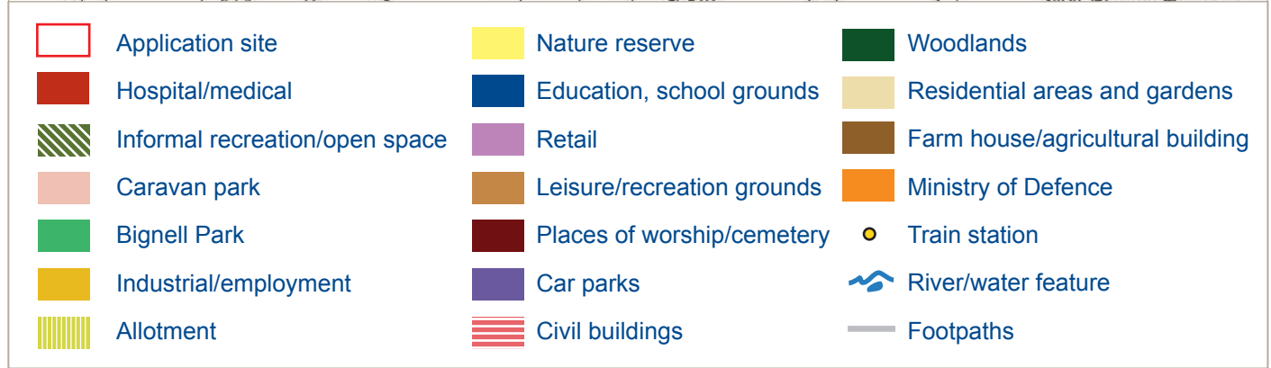
Figure 2.2 Site characteristics and context