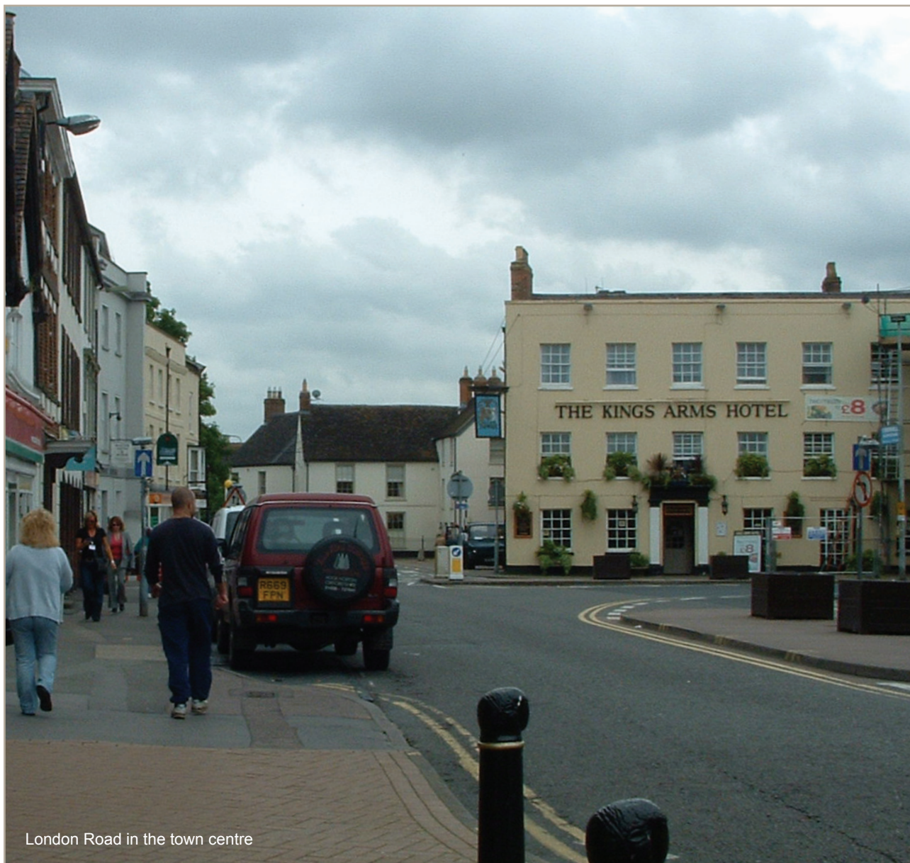
London Road in the town centre

6.1.2. The master plan meets these seven standard objectives of inclusive design in various ways: