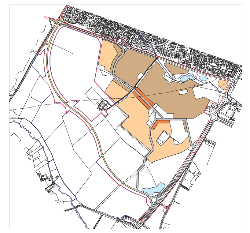
Figure 5.6 Density plan