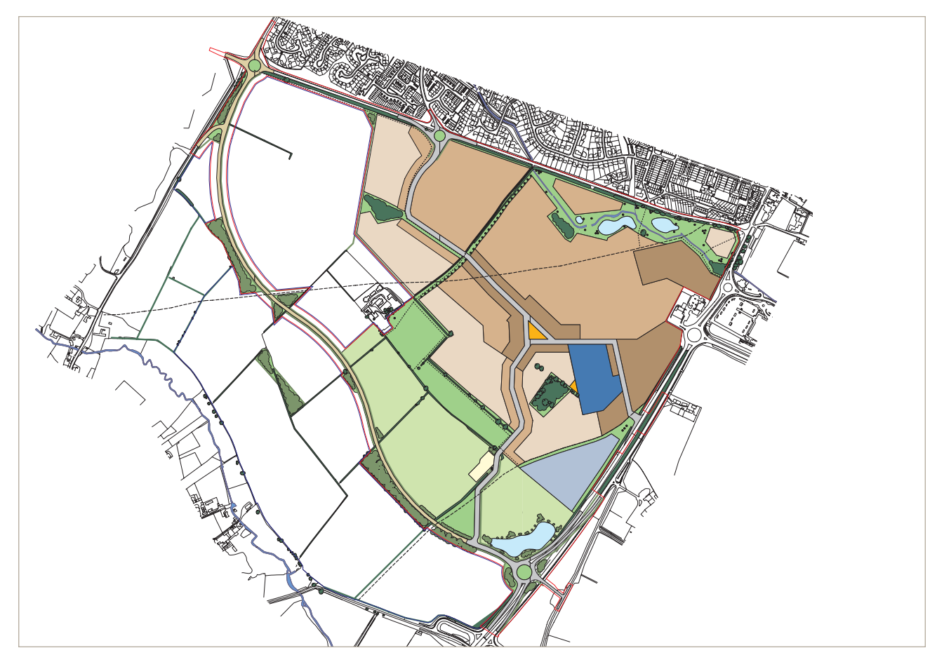
Figure 5.7 Building heights plan