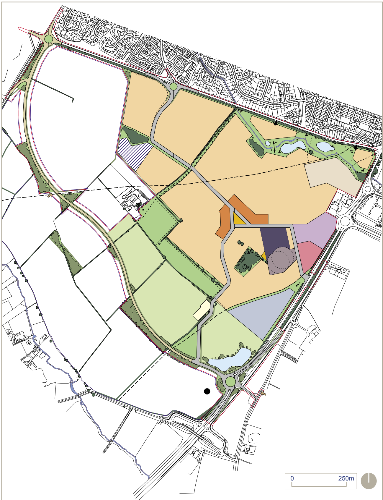
Figure NTS 2 Master plan