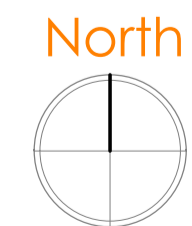
Location Plan 1 1 : 1250

%%169Crown Copyright and database rights 2024 OS Licence no. 100059809