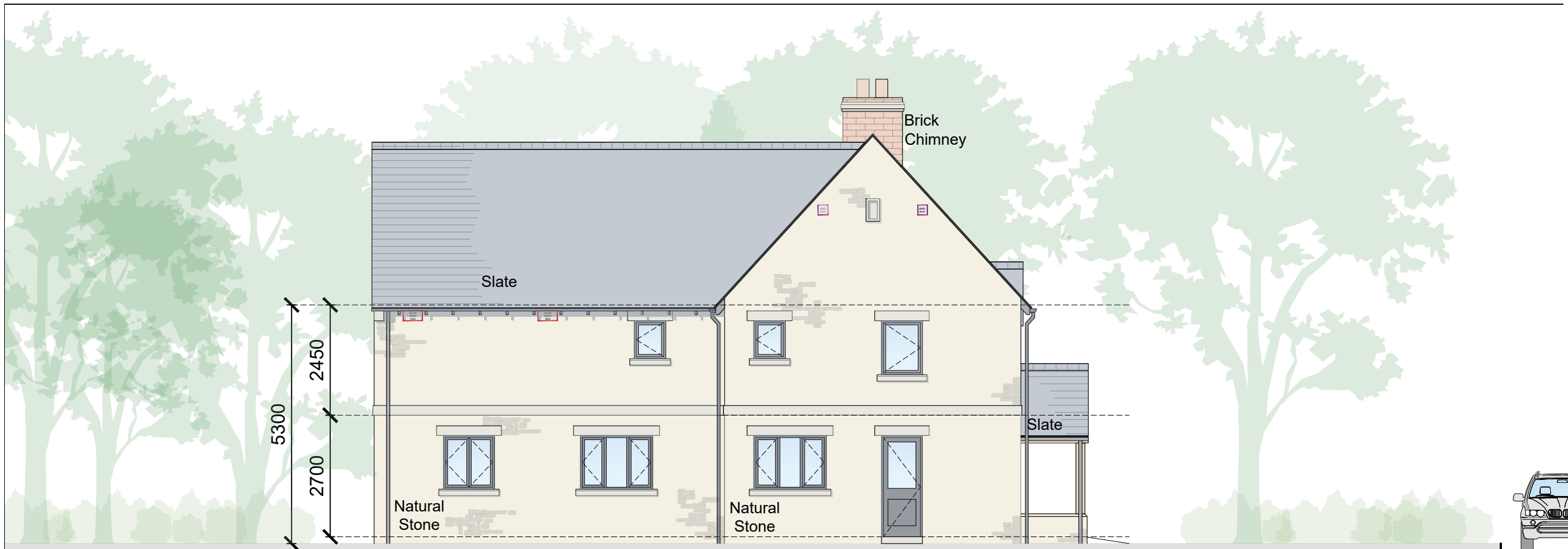
Proposed North Side Elevation 1:100 @ A3