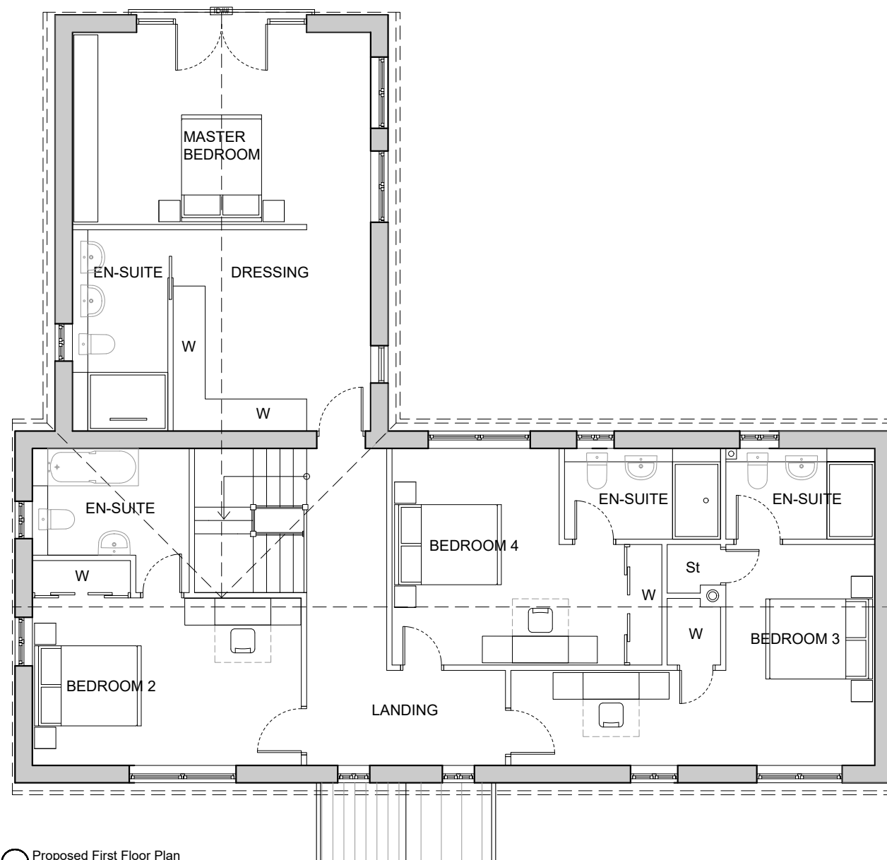
Proposed First Floor Plan 1:100 @ A3