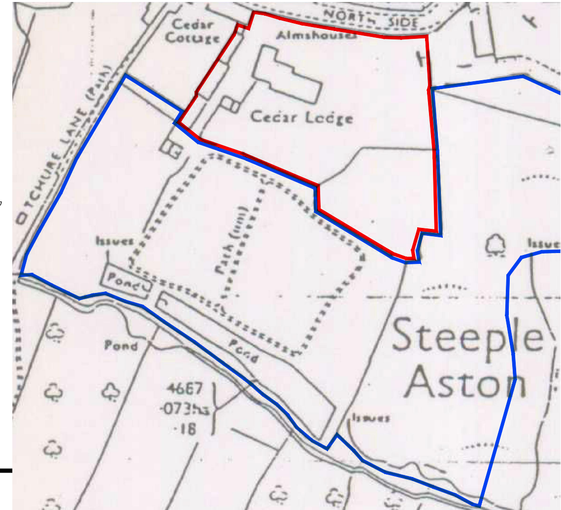
Site Location Plan 1:1250