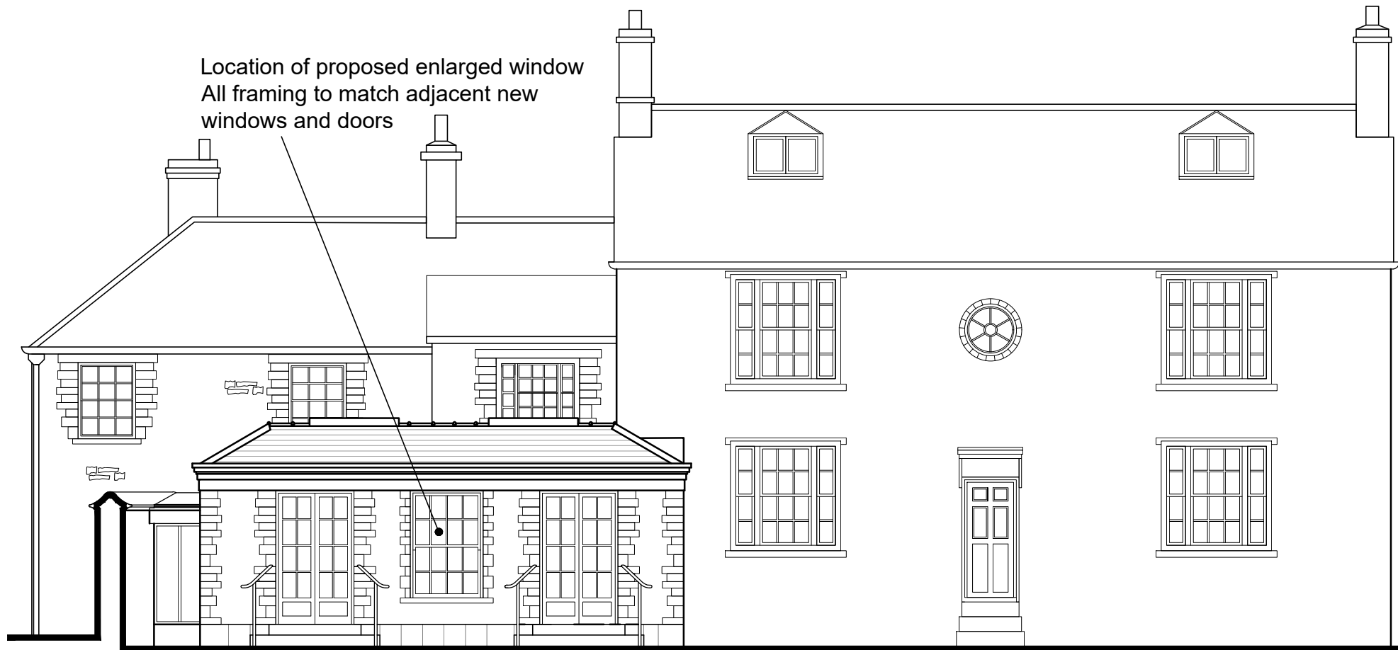
Proposed elevation showing enlarged window location 1:100