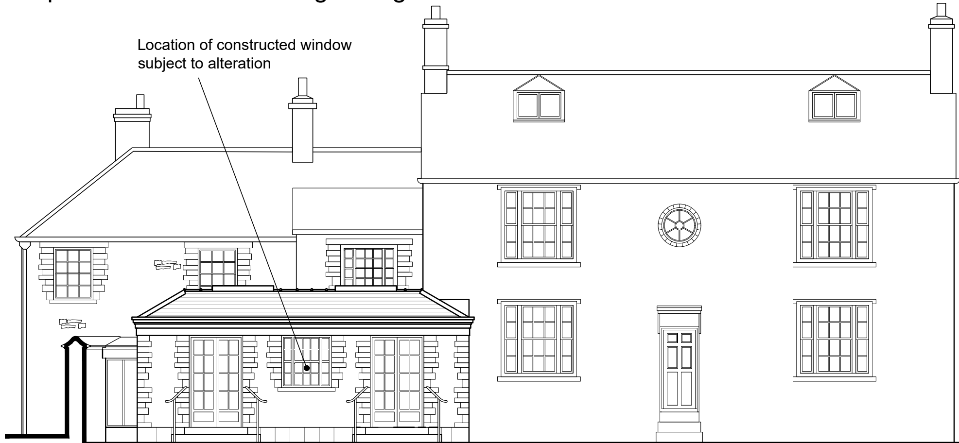
Consented elevation of extension 1:100