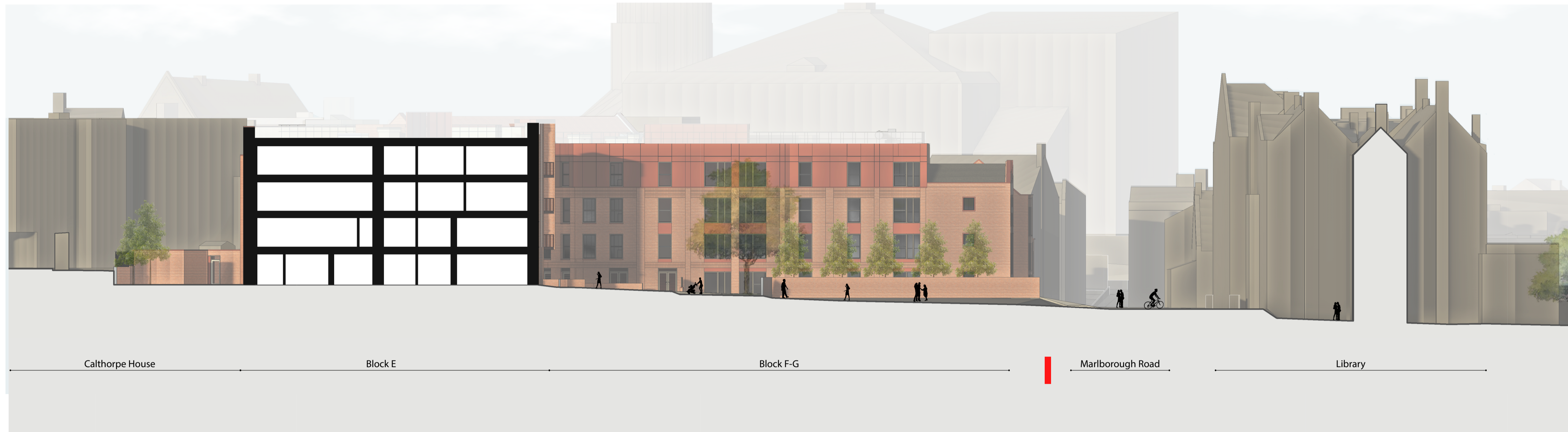
1 Marlborough Road - Library Proposed Section 1 : 200