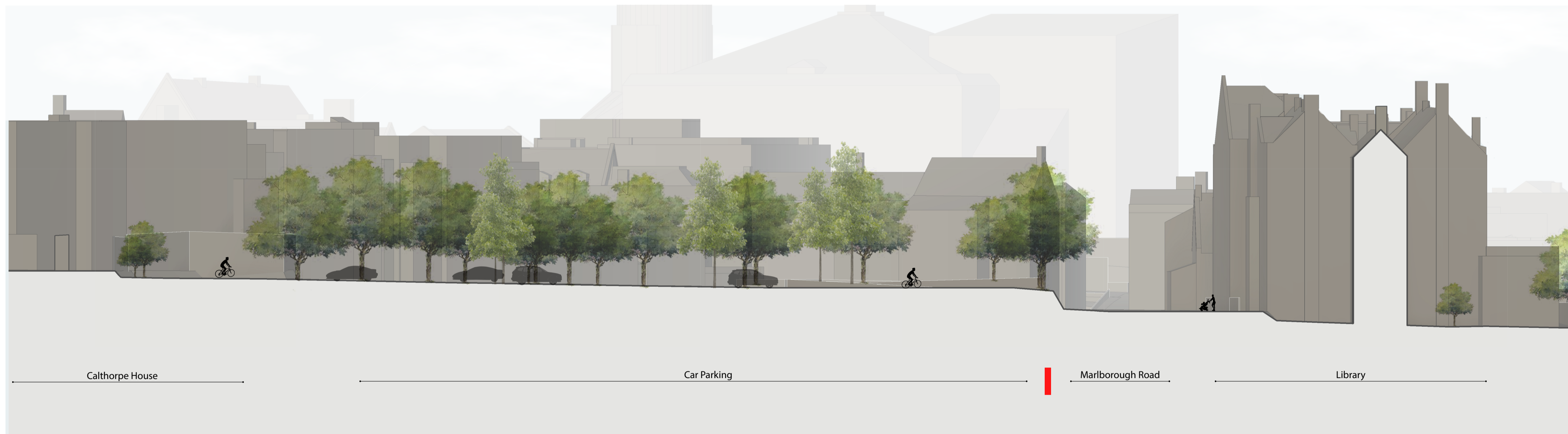
2 Marlborough Road - Library Existing Section 1 : 200