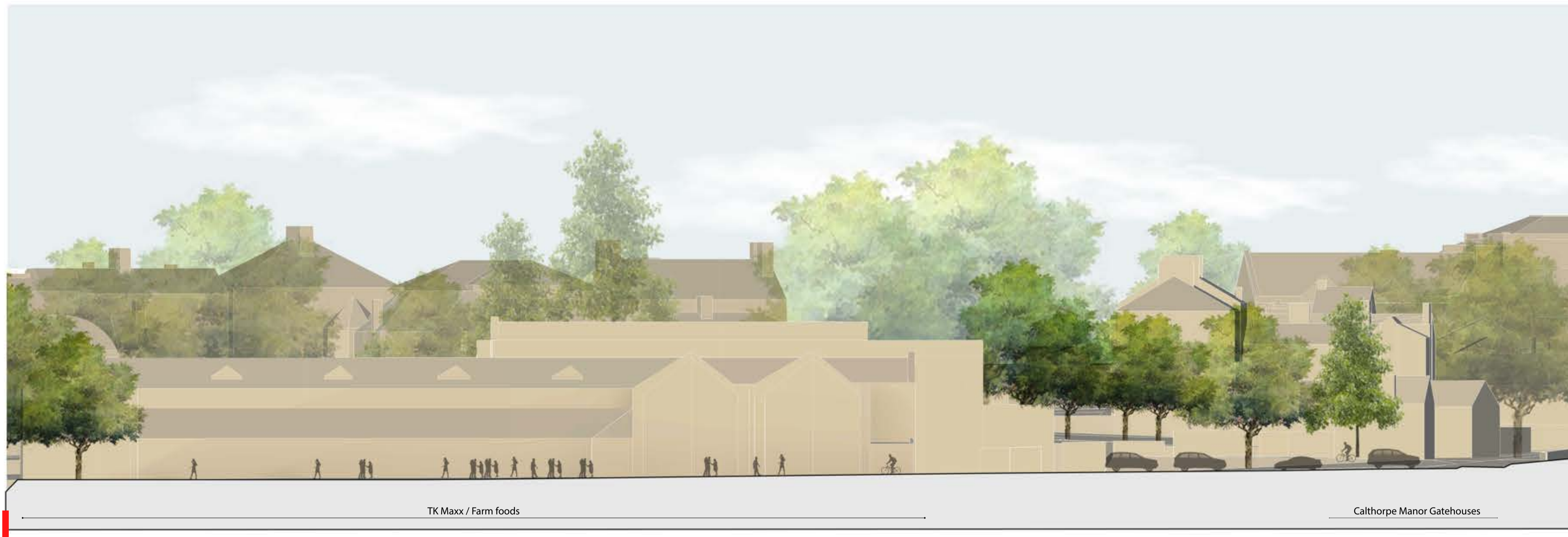
1 Existing Site Section 06 1 : 200