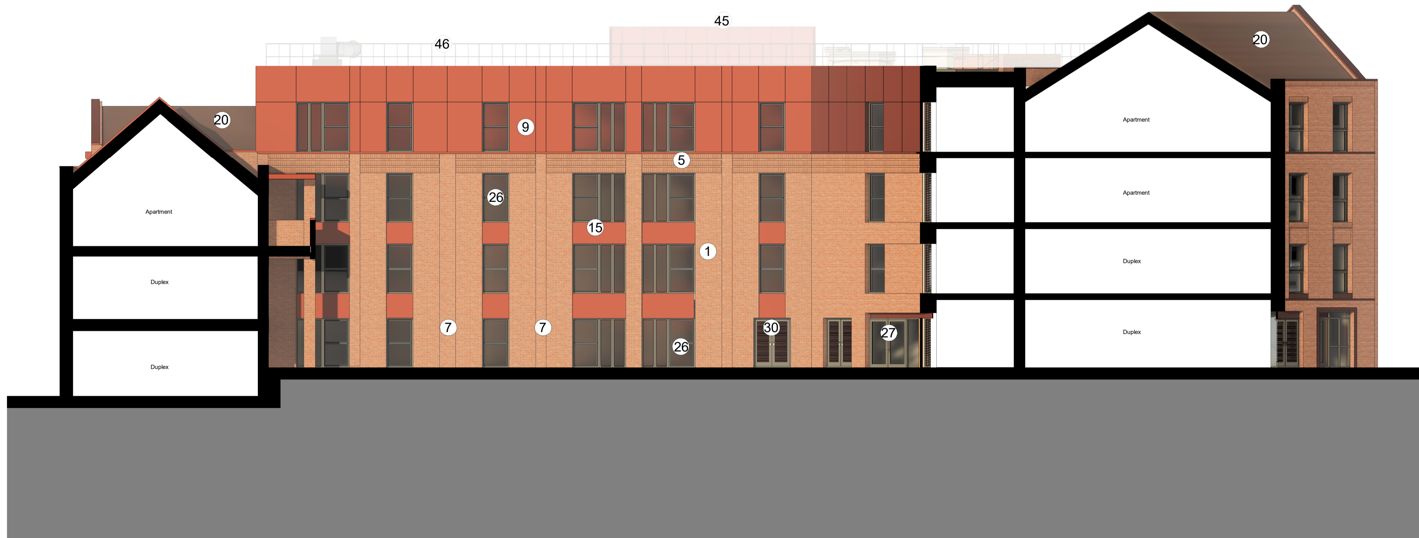
1 North Western Elevation 1 : 100