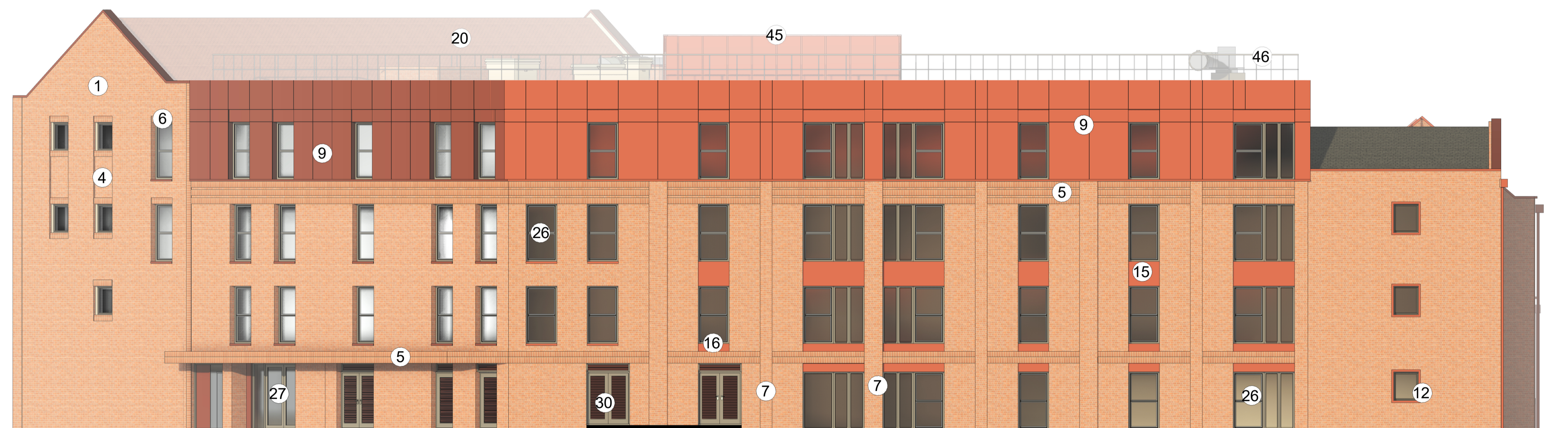
1 South Eastern Elevation 1 : 100