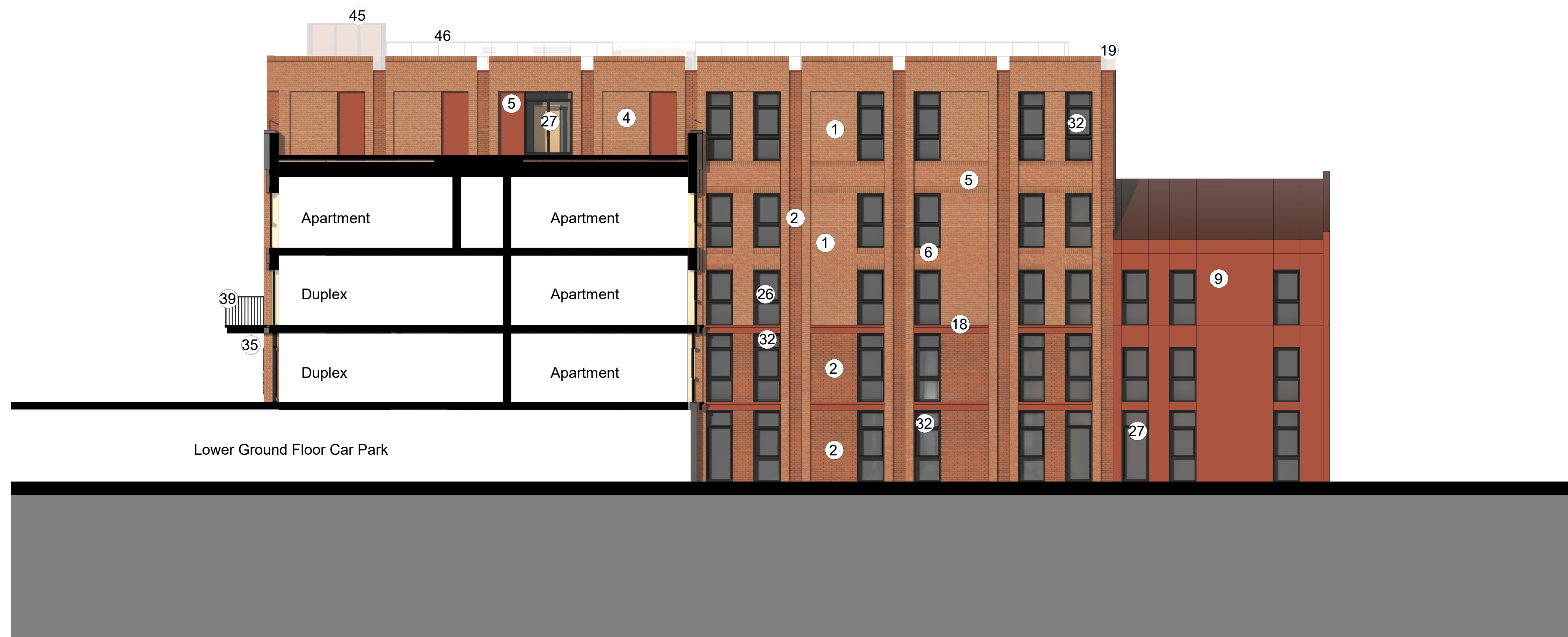
1 Block C-D South Elevation 1 : 100