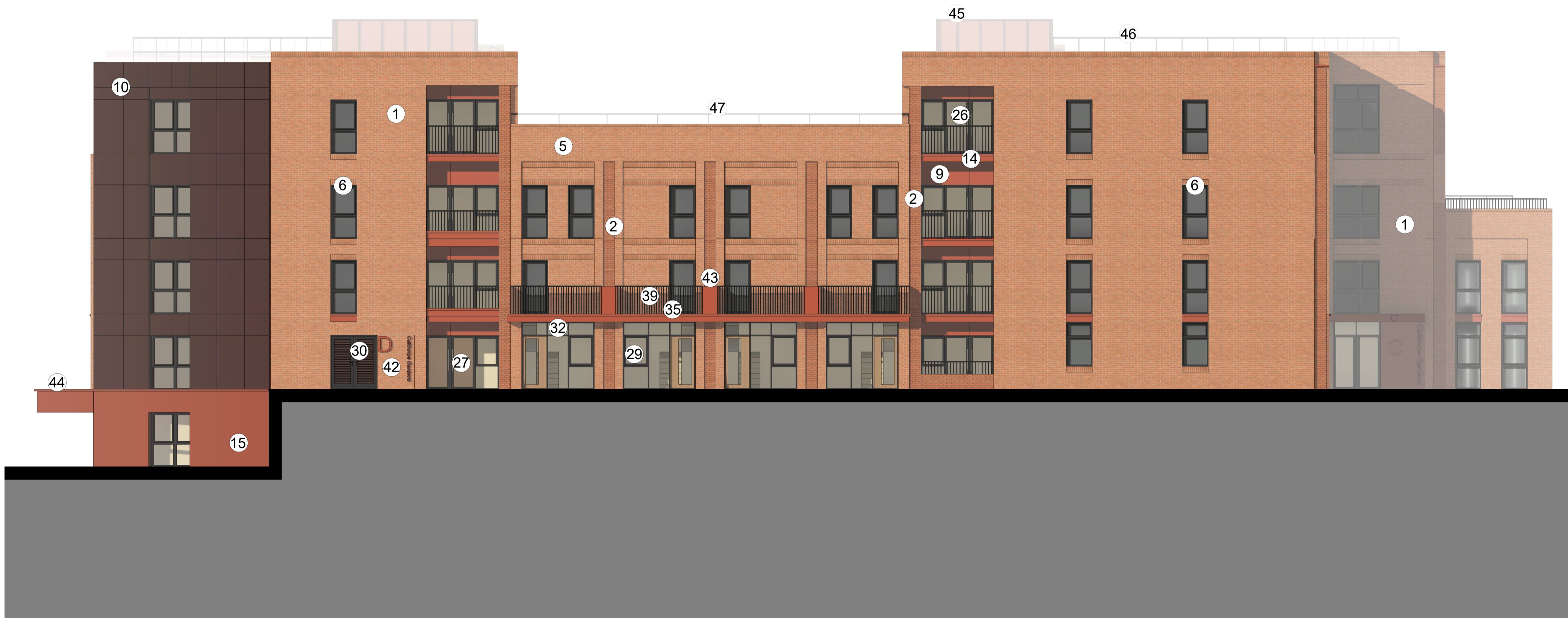
1 Block C-D West Elevation 1 : 100