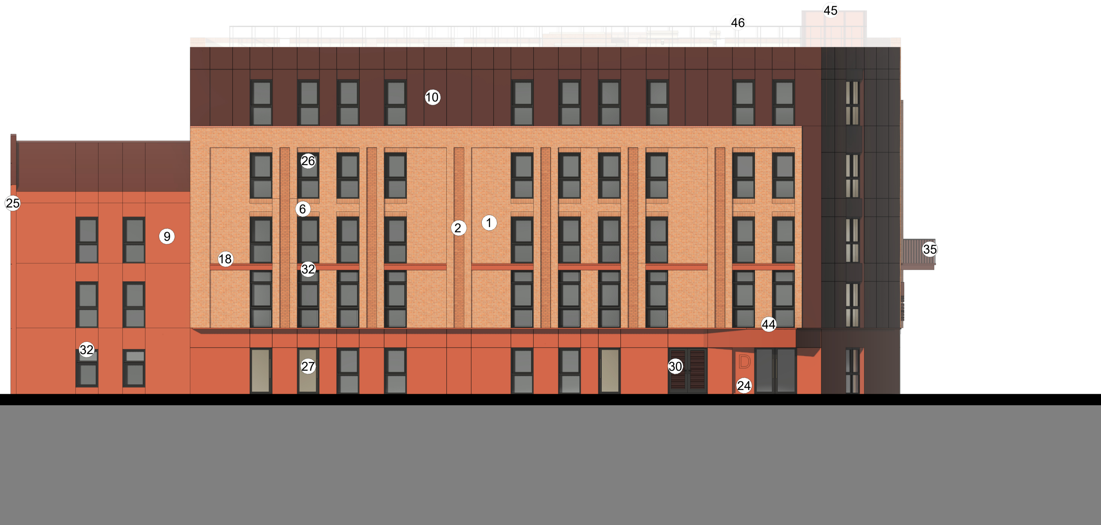
1 Block C-D North Elevation 1 : 100