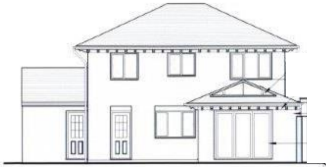
1 south elevation as proposed P104A 1:100