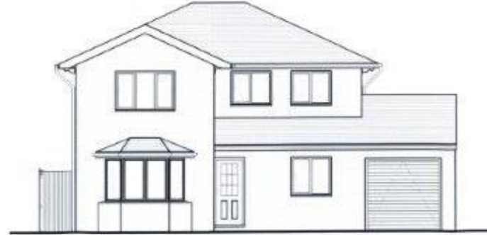
4 north elevation as proposed P104A 1:100