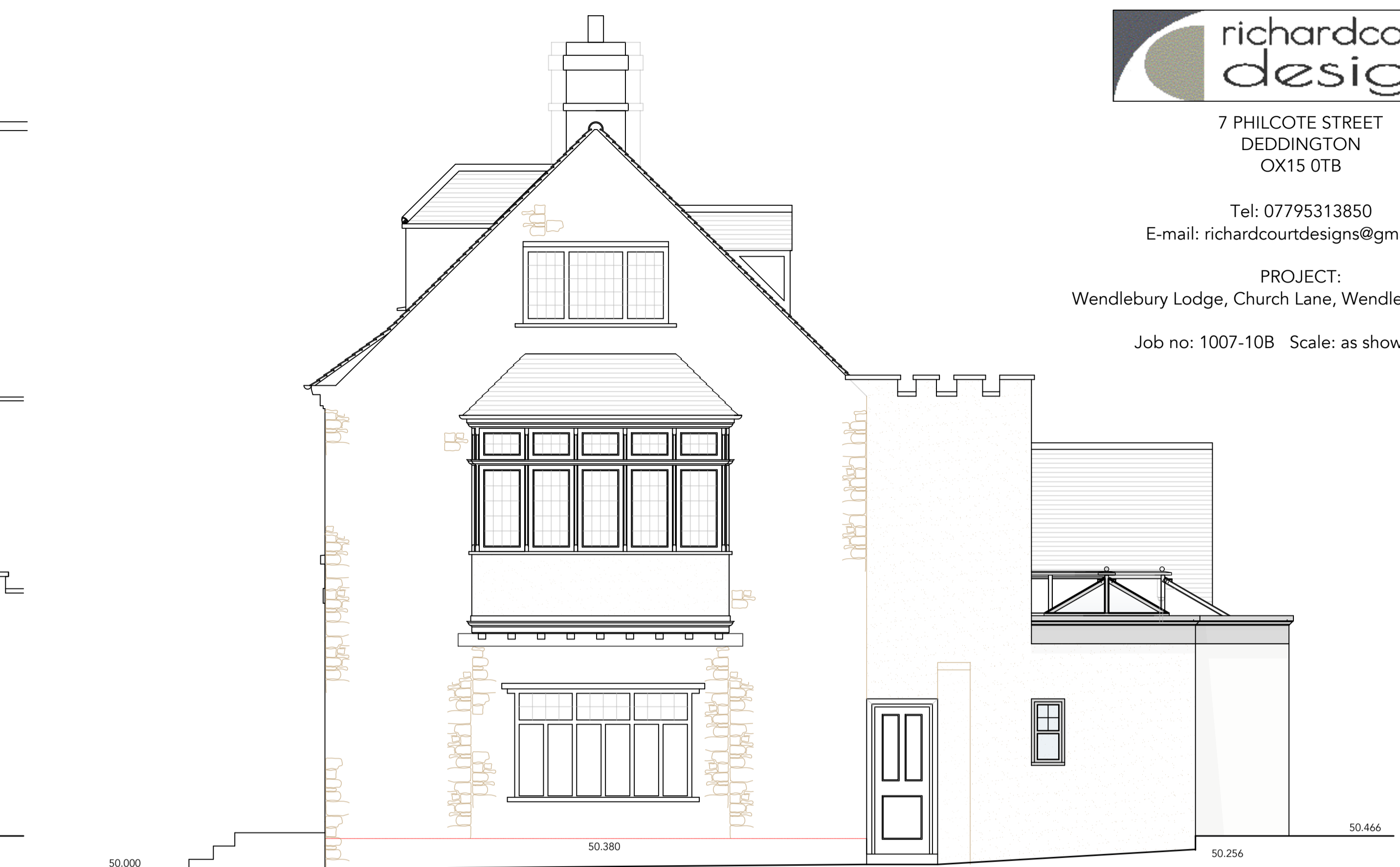
East Elevation 1:50