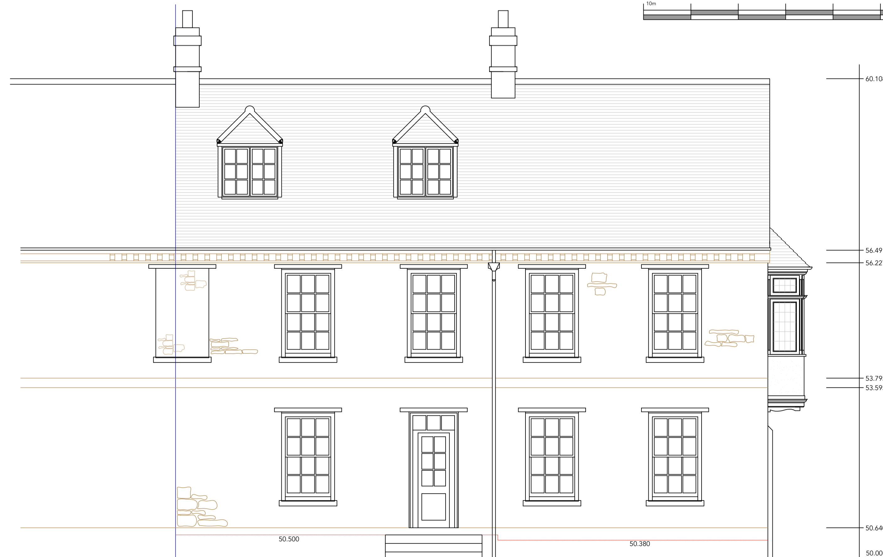
South Elevation 1:50