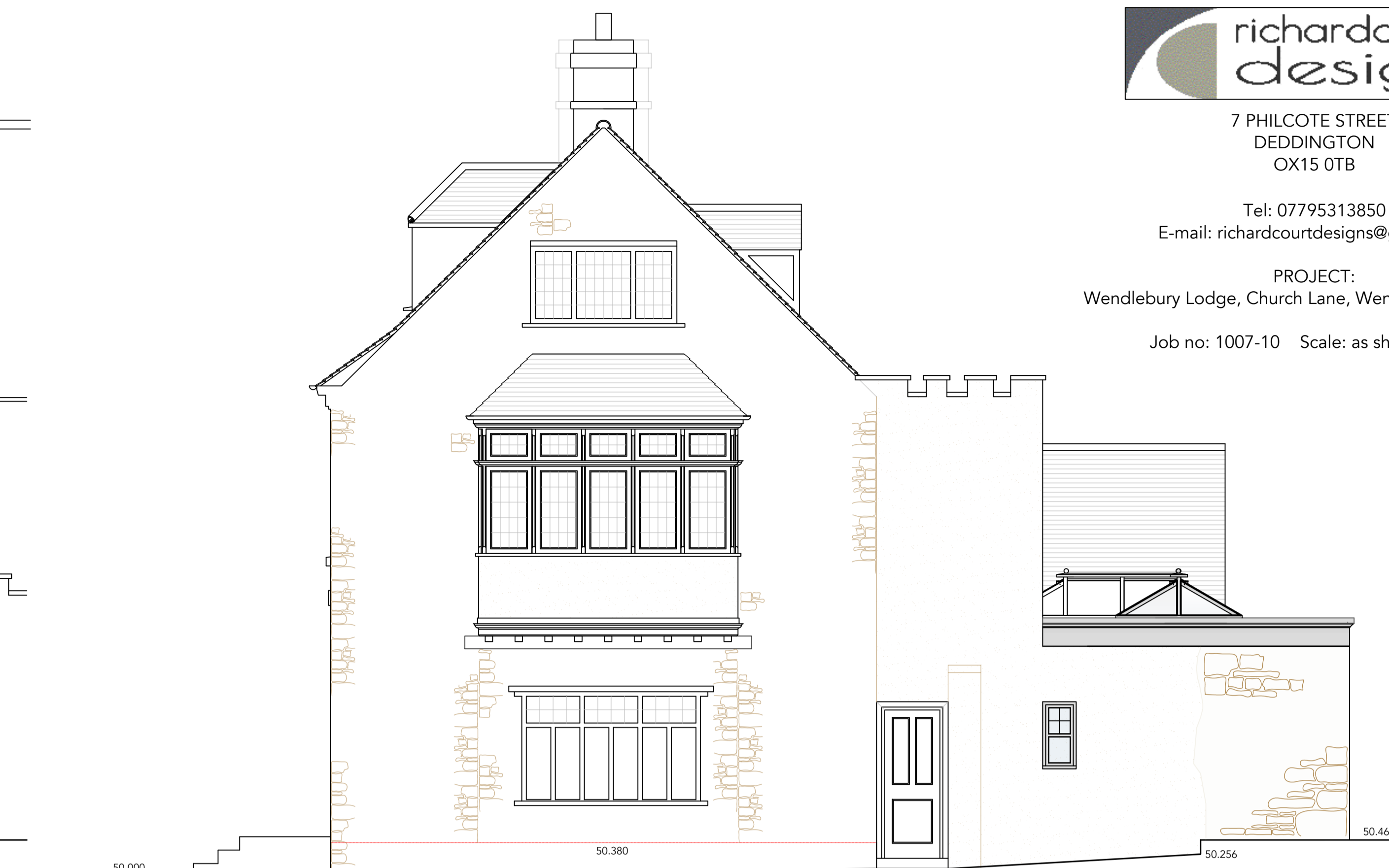
East Elevation 1:50