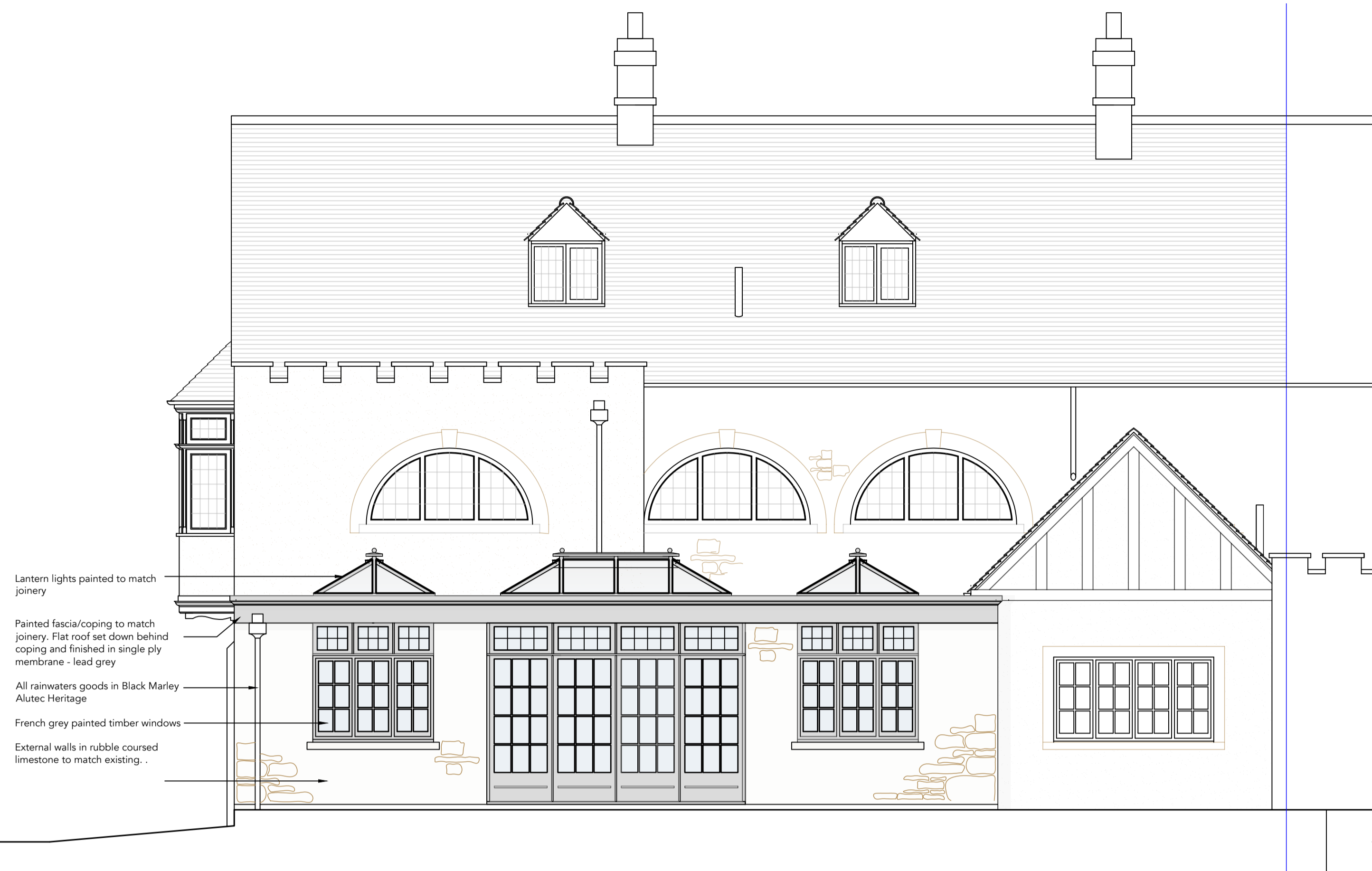
North Elevation 1:50